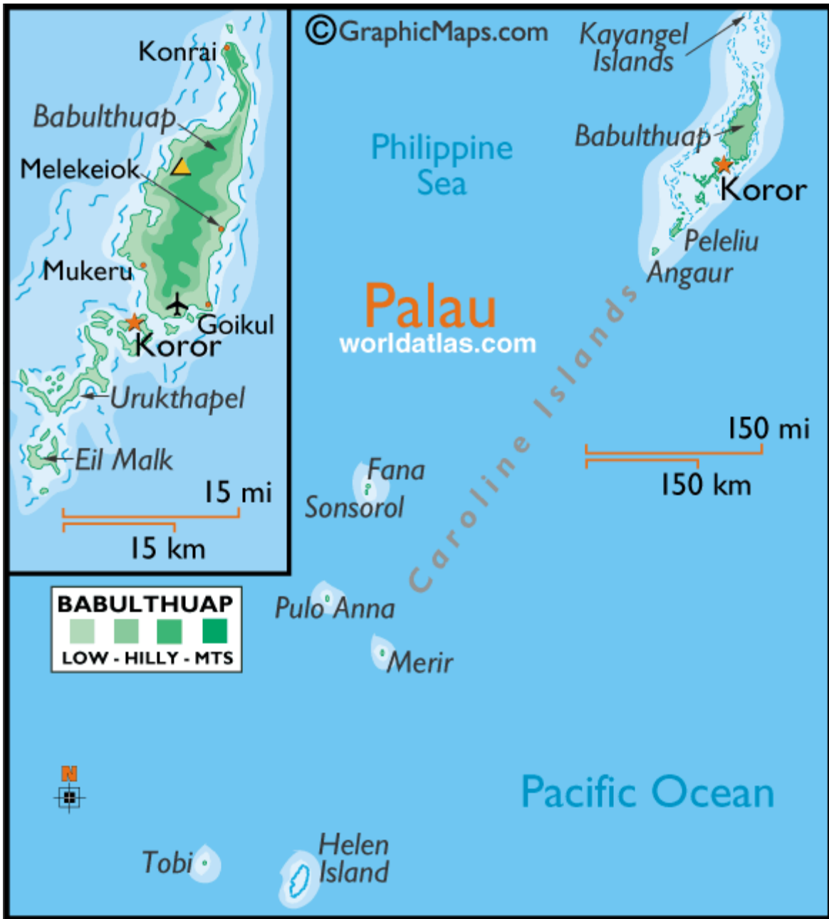
Figure 1. Map of the Republic of Palau