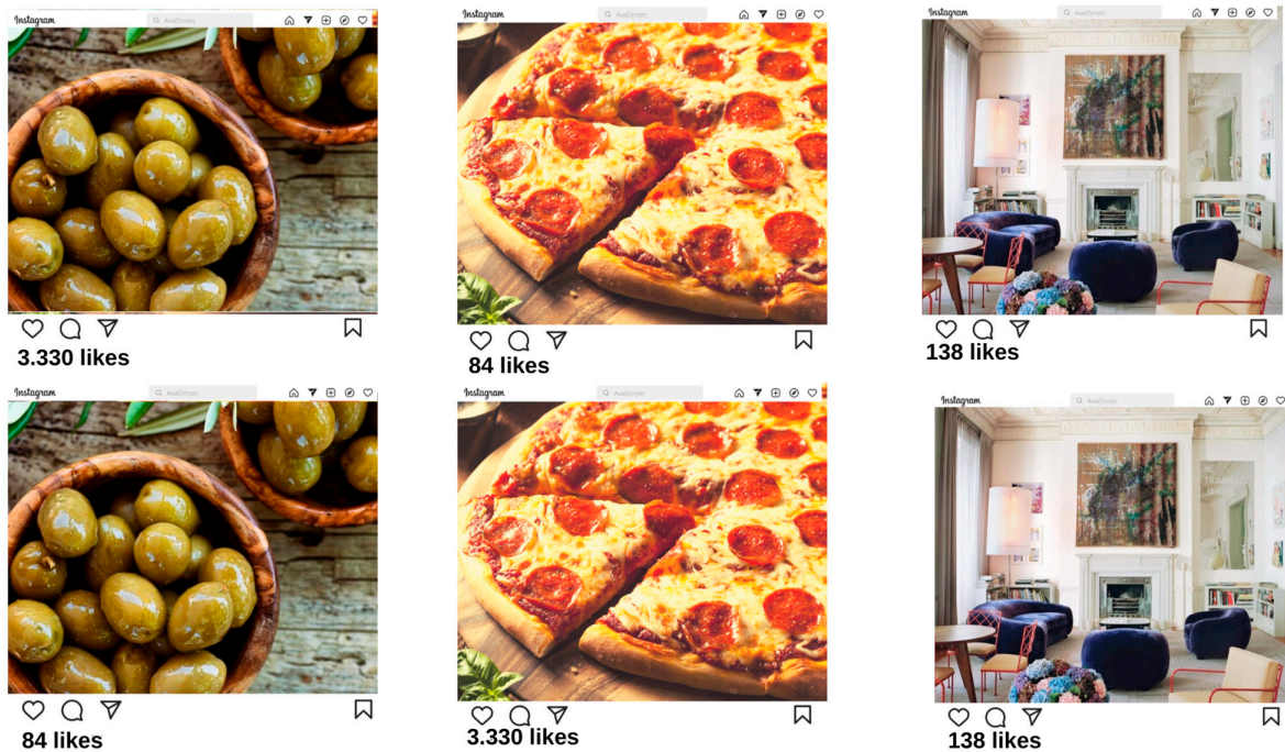
Figure 2. Example of socially endorsed images.

should be controlled. To conclude the survey, participants were questioned on what they believed the study’s goal was, providing an open-ended response as a manipulation check. Each session lasted no longer than 35 min.