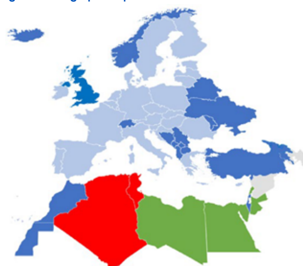
Figure 1: Geographical presentation of the RCEP members

Note: Countries following the open model are indicated in green, those following the closed data model are shaded red, and those following the EU data model are shown in blue. The EU countries that have adopted the EU digital regulations are shown in light blue, while other neighbouring countries are shown in dark blue to indicate that they follow the EU model. Countries for which no data is available are shaded grey.