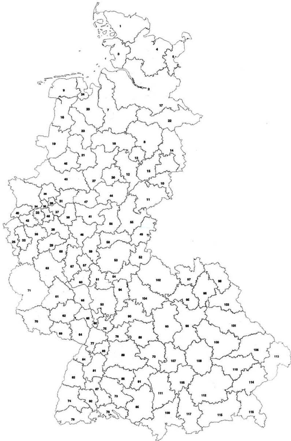
Figure 2: Regional Labor Markets in West Germany