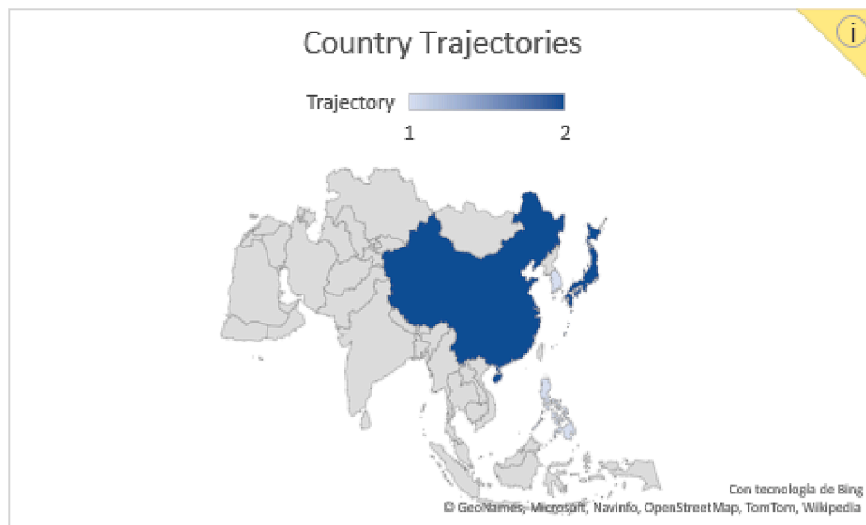
Fig. 1. Country trajectories.