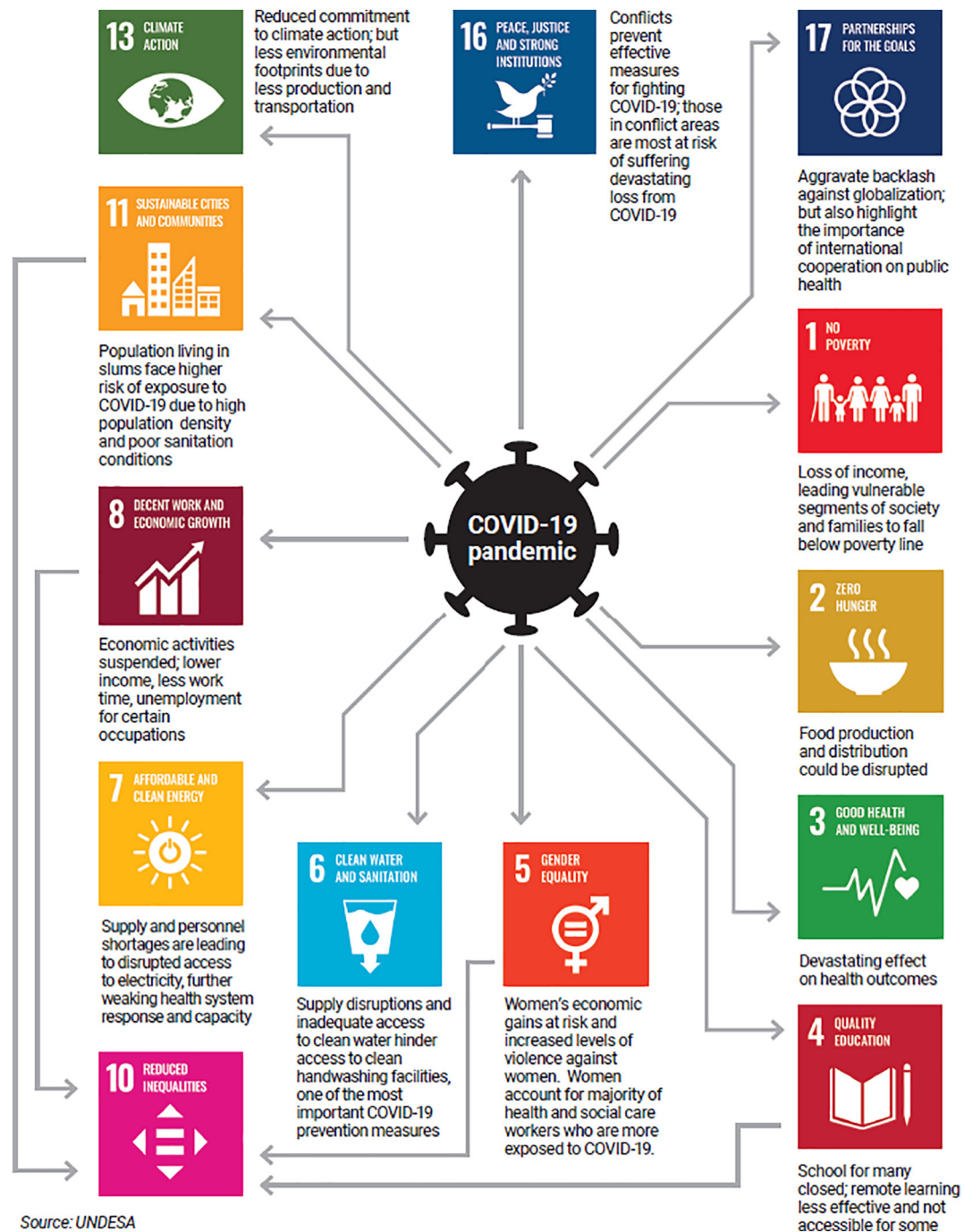
Fig. 2. COVID-19 pandemic on the SDGs.