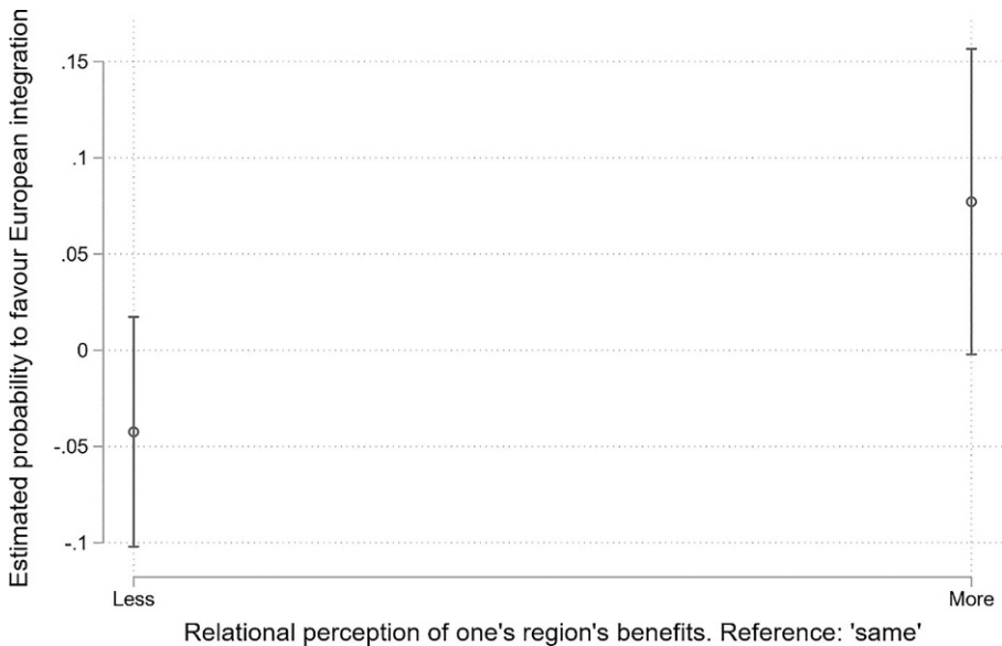
Fig. 4 Average marginal effects for respondents to favour European integration based on their relational perception that their region benefits more or less from European Union funding than other regions in their country. Estimates are based on model 10 in Tab. 5 in the appendix