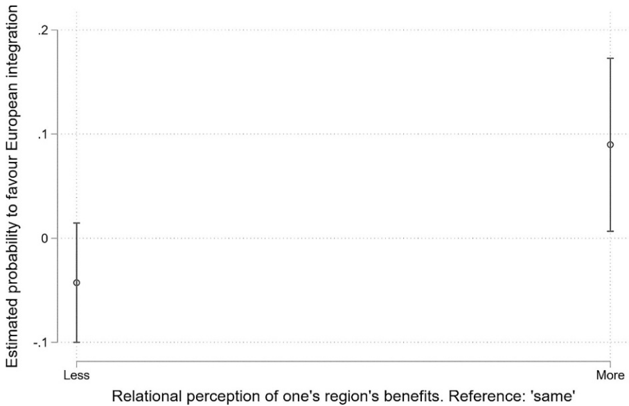
Fig. 3 Average marginal effects for respondents to favour European integration based on their relational perception that their region benefits more or less from European Union funding than other European regions. Estimates are based on model 8 in Tab. 5 in the appendix