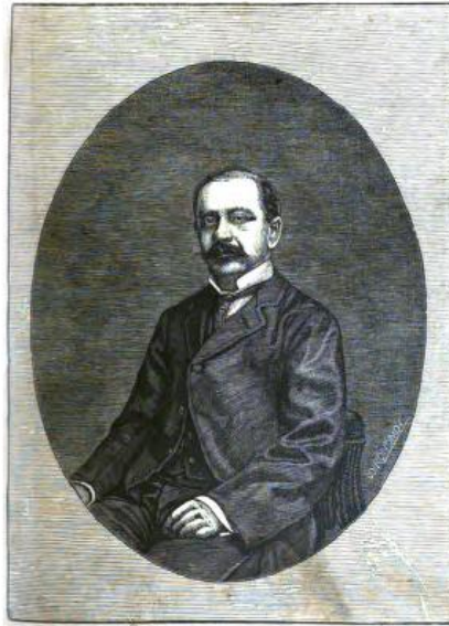
ΧΑΡΙΛΑΟΣ Σ. ΤΡΙΚΟΥΠΗΣ