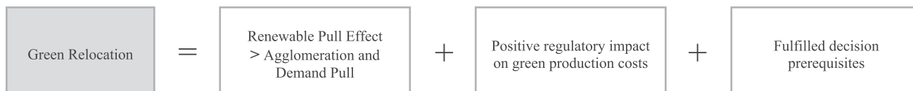
FIGURE 3 | Theoretical model illustrating how the renewable pull effect leads to green relocation of energy-intensive production.

in strategic green relocation decisions, our study advances this understanding by empirically identifying and assessing these factors in direct comparison to those representing the renewable pull effect—an approach not previously addressed in academic literature, to the best of our knowledge.