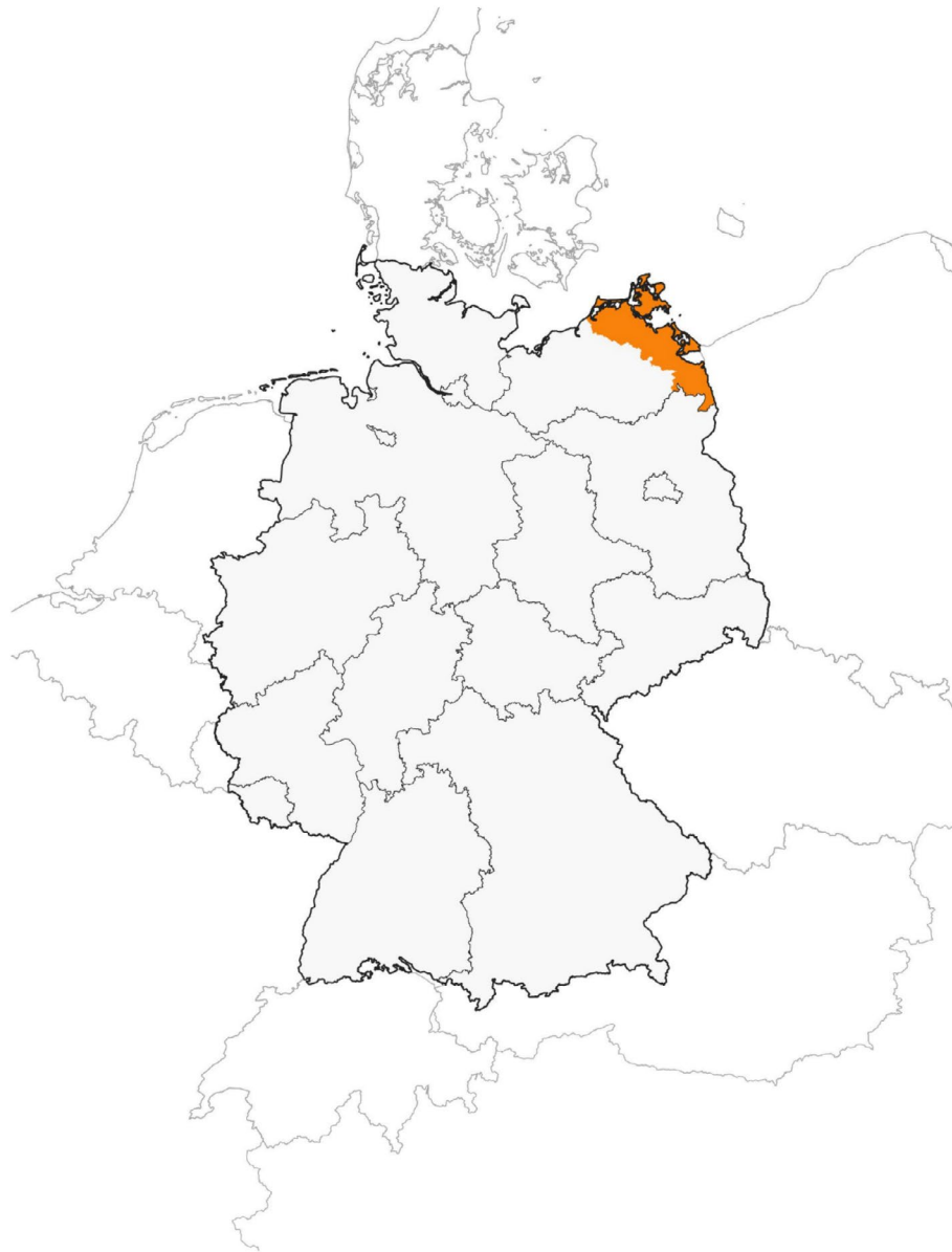
FIGURE 1 | Study area, Source: Stephan Busse.

cognitive understanding, and the third about demands on the agriculturally shaped environment in Western Pomerania. A final section asks about sociodemographic characteristics. The content is oriented toward the main conflict lines in Western Pomerania, which include attitudes and contextual knowledge about conventional and organic agriculture, paludiculture, and regional product value chains, but also cultural ecosystem services that people receive from the environment, their everyday experiences with the agriculturally shaped environment, and their direct contact with agriculture. Among the sociodemographic variables, net income and life satisfaction were summarized into three and five categories, respectively, for easier interpretation. For more details about the questionnaire see Maruschke et al. (2024).