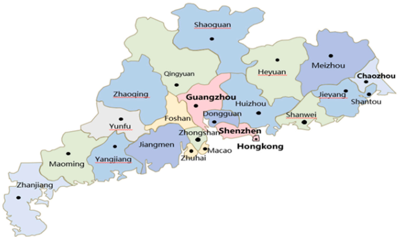
Fig. 1. City map of the Pearl River Delta.

evaluate the efficiency of the container terminals. We used gross crane productivity (from the perspective of mechanical facilities), cranes intensity, berth depth, and berth length of the container terminals as input factors, calls, moves and finish as output factors. By doing so, we expect to provide a reference for future regional logistics development planning.