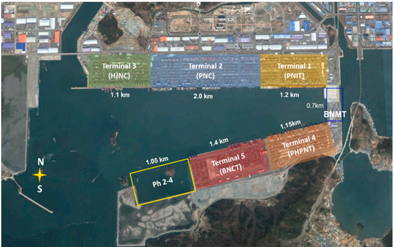
Fig. 1. Terminals and terminal operators in Busan New Port.