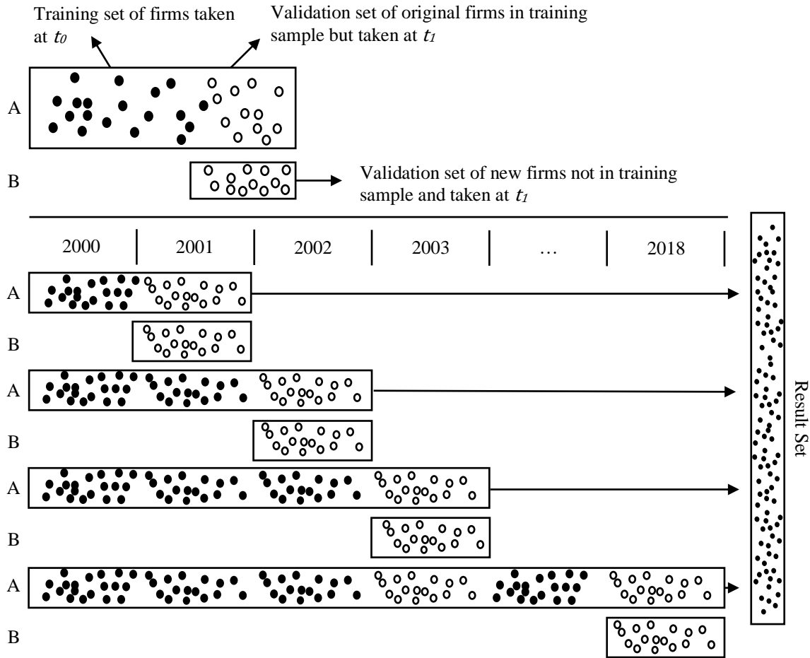
Figure 1. Schematic of the walk-forward testing approach