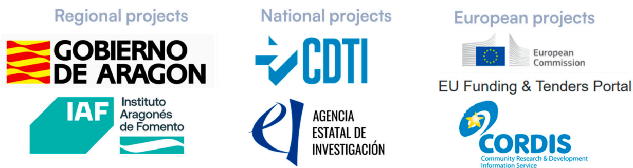
Figure 1. Project data sources considered in the analysis.

All funding programs examined in this study are based on competitive public calls, in which multiple independent entities submit proposals to secure financing, with selection decisions made according to the merits of their projects and alignment with predefined objectives. This competitive process is distinct from nominative funding, where projects are directly financed without a competitive evaluation—often earmarked for specific entities or initiatives without the need for proposal submission and review. Based on this framework, the primary data sources for this study are shown in Figure 1.