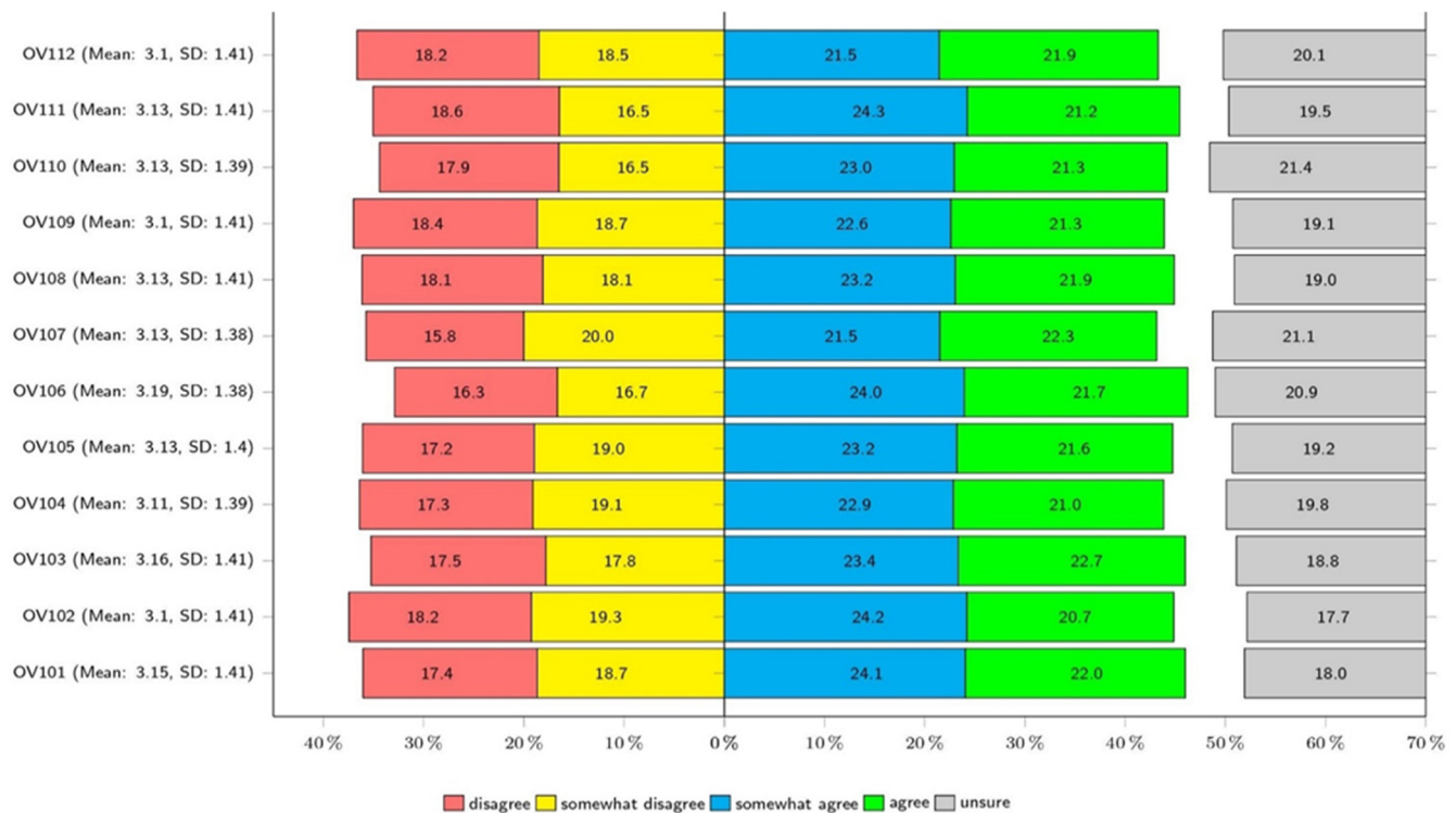
Figure 2. Lessons learned in rebuilding agriculture, forestry, and fisheries in the affected areas. Note: See Table 2 for the evaluation items for OV101 to OV112 in the figure.

Figure 2 gives the results of responses regarding the evaluation of “lessons learned for rebuilding agriculture, forestry, and fisheries in the affected areas (H1)”. The highest-rated item was “creation of agricultural business models (OV107)” (46.3%). Following this were “consolidation of farmland (OV101)” (46.0%), “effective utilization of farmland (OV103)” (46.0%), and “creation of agricultural business models (OV107)” (45.5%). Around 40% of respondents indicated a desire to learn lessons for rebuilding agriculture, forestry, and fisheries in the affected areas, expressing expectations for the development of new agricultural and industrial clusters.