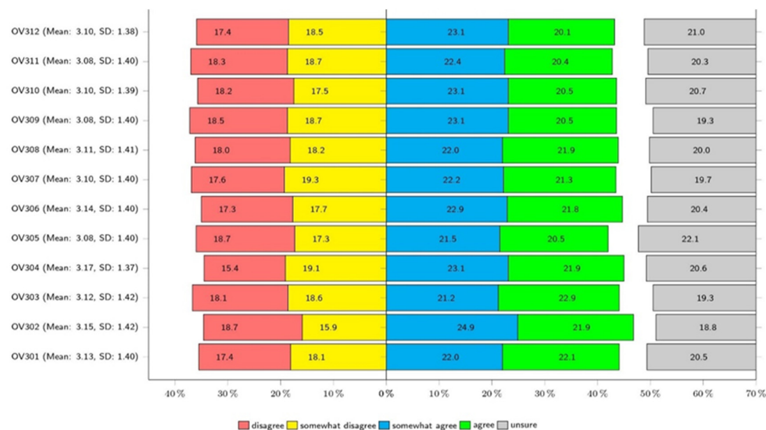
Figure 4. Lessons learned in the reconstruction of industries, commercial facilities, and shopping areas in the affected areas. Note: See Table 4 for the evaluation items for OV301 to OV312 in the figure.

Figure 4 depicts the evaluation of “lessons learned for rebuilding industries, commercial facilities, and shopping districts in the affected areas (H3)”. The highest-rated items were “long-term business revival support (OV302)” (46.8%), “promotion of full-scale industrial recovery (OV303)” (45.0%), and “product development through industry-academia collaboration (OV306)” (44.6%). Approximately 40% of respondents indicated a desire to learn lessons for rebuilding industries, commercial facilities, and shopping districts in the affected areas.