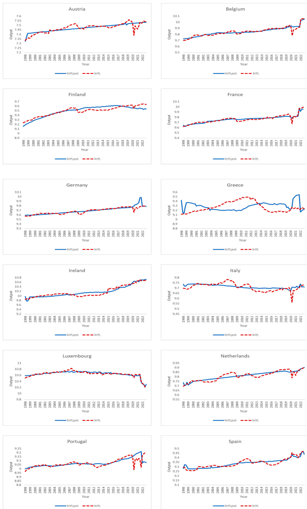
Figure 3. Potential and actual output per MS.