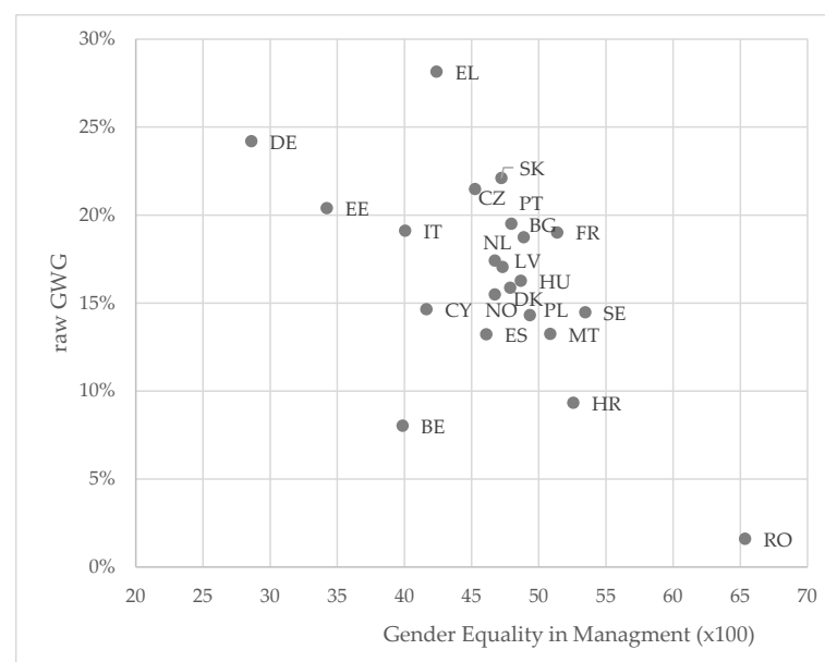
Figure 1. Gender equality in management and the raw GWG.

Additionally, Figure 1 plots each country in the sample, with the unadjusted gender pay gap on the y-axis and the average of the GEMP index on the x-axis. As can be seen, the cloud of points shows a certain negative trend, indicating that those countries where the GEMP index is higher on average have a lower GWG.