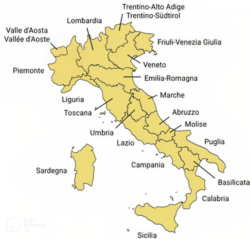
Figure 1. A map illustrating the geography of Italian administrative regions (Source: own elaboration on Eurispes (2022)).

Marche and Umbria. The South/Islands macro-area includes Abruzzo, Basilicata, Calabria, Campania, Molise, Apulia, Sicily, and Sardinia (Salvati et al. 2008).