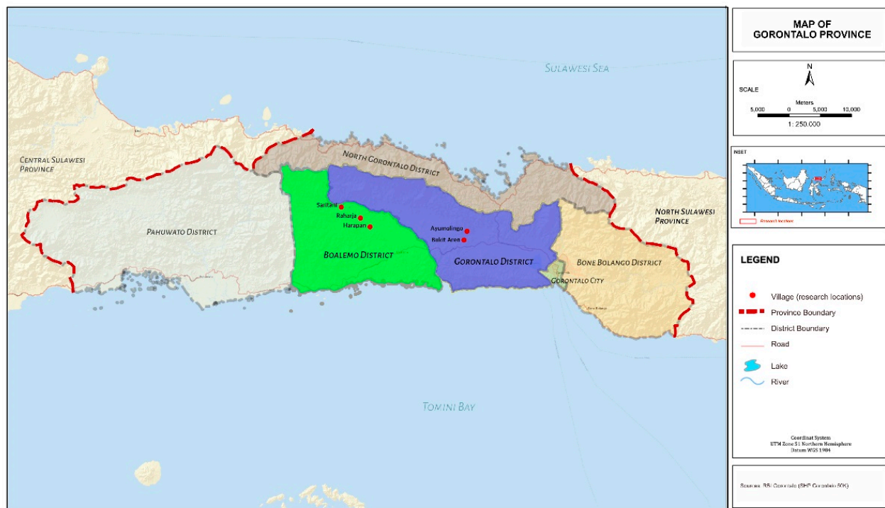
Figure 2. Location of five villages as research site in Boalemo and Gorontalo district map of Gorontalo province, Indonesia.

Gorontalo and Boalemo Districts, as the location of this research, are two regional government areas in Gorontalo Province. Based on the geographical position shown in Figure 2, it is explained that Boalemo District in the north is bordered by North Gorontalo District, in the south by Tomini Bay, in the west by Pohuwato District and in the east by Gorontalo District.