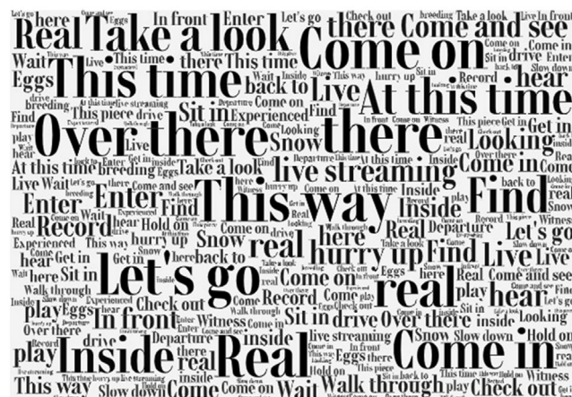
Word cloud map of documentary narratives