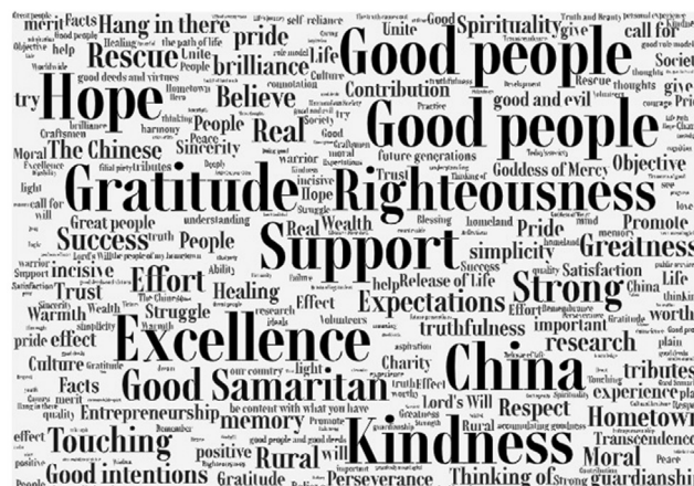
Word cloud map of Shared sense of meaningfulness