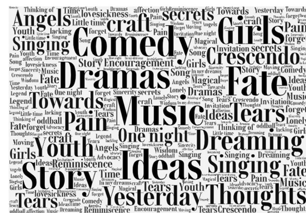
Word cloud map of fictional narratives