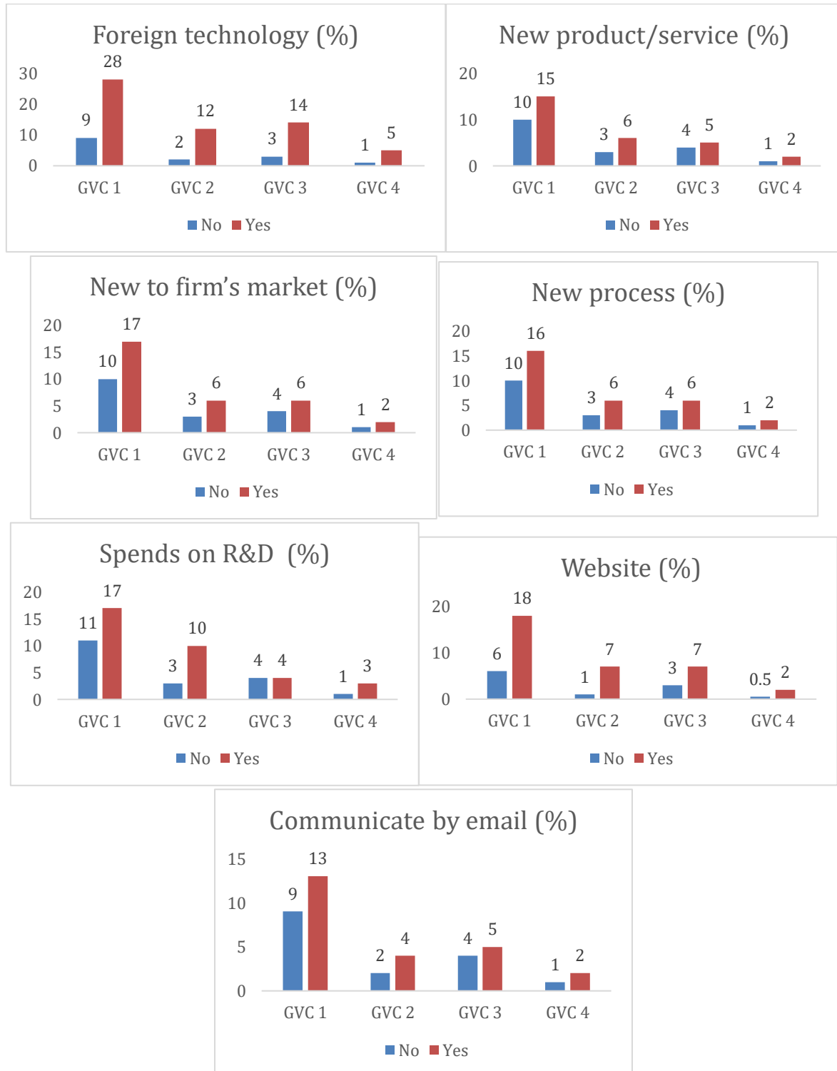
Figure A1. GVC measures by innovation indicators