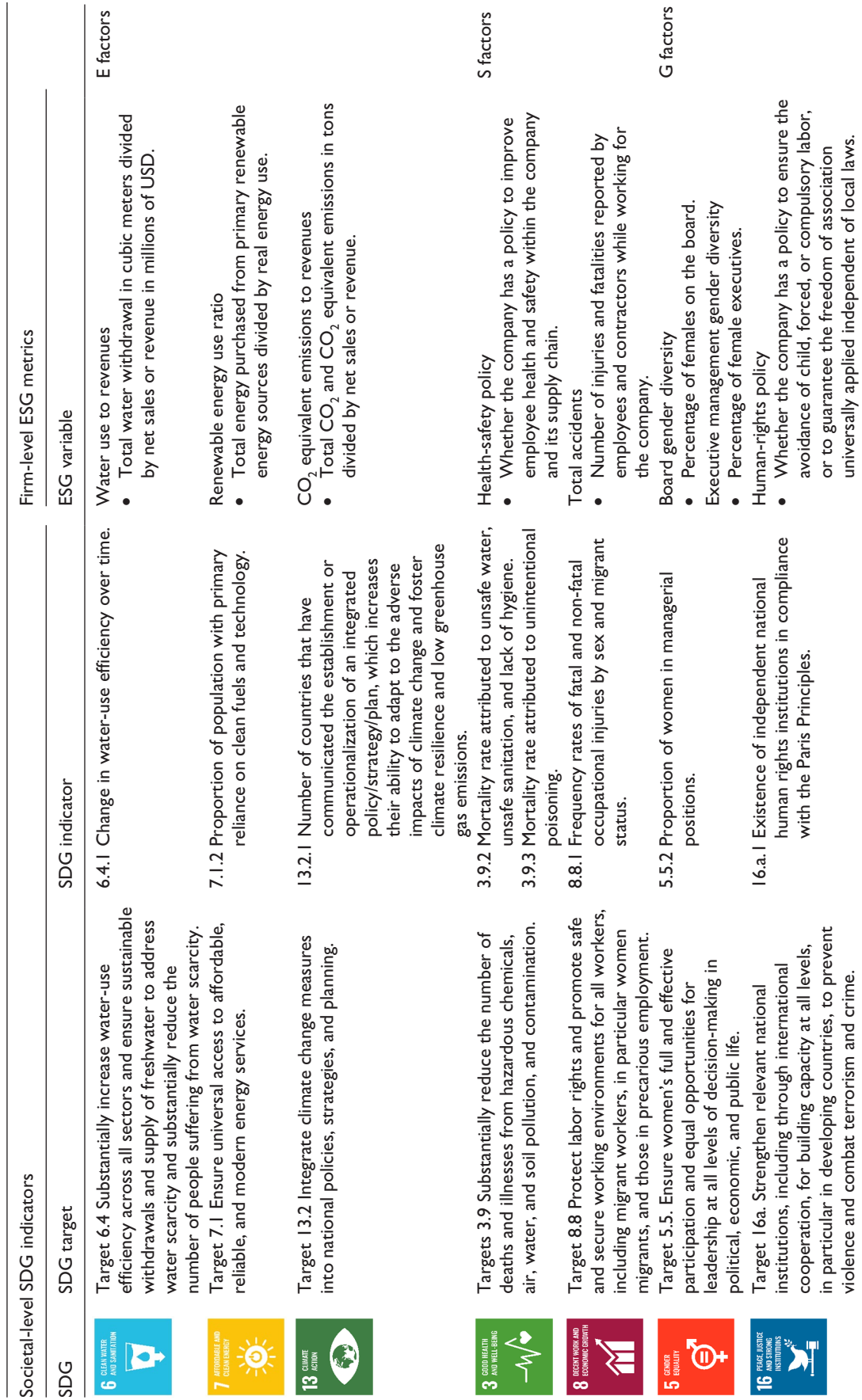
Table 1. Sample equivalences between societal-level SDGs and firm-level ESG factors.

The use of SDG icons is permitted under the UN Department of Global Communications (UN, 2019).