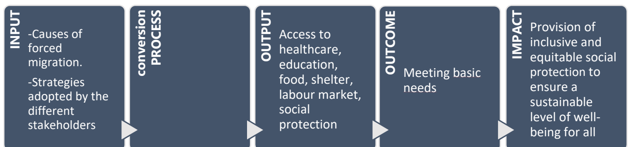
Graph 1: Input-Impact process frame

Bringing the prior discussion together, a Theory of Change (ToC) is developed to visualise taking an approach of input of displacement to an impact of development. The initial conditions of forced displacement form the starting point of any design that ultimately develops into the delivery of transformative social protection – see Graph 1. This ToC is grounded in cosmopolitanism and recognises the responsibility of the plenitude of actors as discussed in section II. Inputs for the input-impact model include both the causes that have generated forced displacement and the strategies adopted by international, national, and local, private and public stakeholders to address the crisis. The intended impact is the provision of inclusive and equitable social protection to ensure a sustainable level of well-being for all, forcibly displaced included (see graph 1 below).