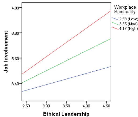
Figure 3. Ethical leadership \times workplace spirituality.

ascertained by Mahipalan and Sheena (2019). It follows that once employees feel a sense of belonging, community, wholeness at the individual level, which culminates into organisation spirituality (Kinjerski & Skrypnik, 2004), idealized influence and ethical leadership will be enhanced to effectively impact EJI. This finding further clarifies that not all the dimensions of transformational leadership requires workplace climate like spirituality to more significantly influence EJI. Hence, this study makes a pioneer contribution to extant literature from a developing context (Figures 2 and 3).