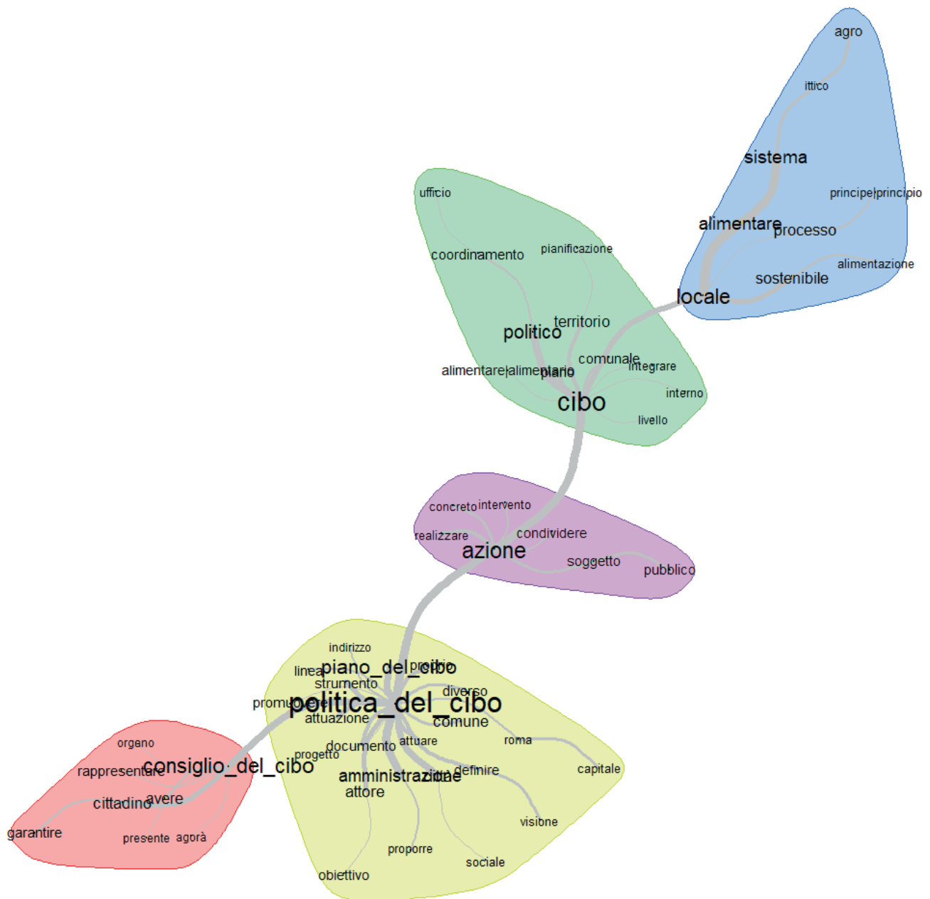
Figure 2. Analysis of similarities in the institutional documentation.

not always a straightforward and shared path, especially when it comes to coordinating different political visions and approaches expressed by local actors. This bias has threatened the capacity to rely on a proper solid literature presenting results and impacts of the construction and systematization in real contexts for long time. Only recently, a robust body of literature has been established assessing and evaluating the impacts of years of policies whose effects were considered positive “per se”. However, food systems face very complex problems linked to