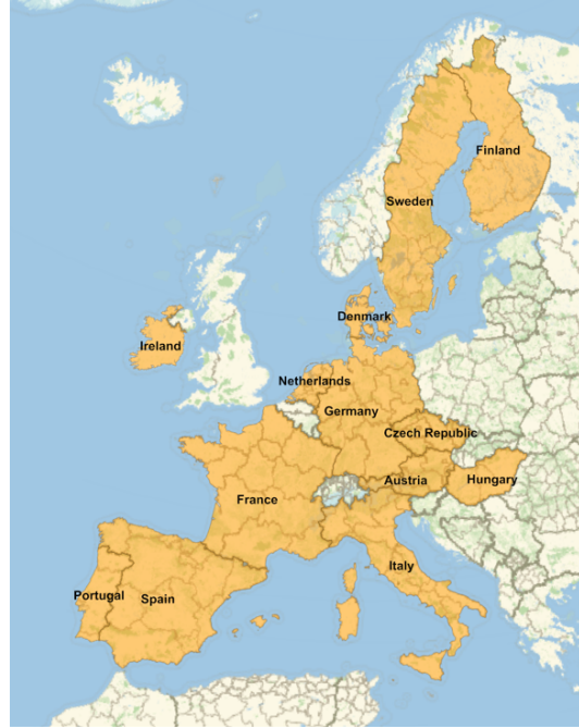
Figure 1: Countries included in Calibration

or dirty sectors when many are neither one nor the other exclusively. To this end, I examine the electricity capacity of the largest electricity firms in Europe, plus the largest electricity provider of each country if they are not among the largest electricity providers in Europe. This leads to a list of 18 firms, corresponding to approximately 70% of the installed electricity capacity in Europe in 2024. Using their annual reports, I derive information on the installed electricity capacity of RES to divide them into dirty and clean. Although nuclear energy is per se emissions free, I categorize it as dirty since it is non-renewable electricity source and it would overinflate investments into and production of clean electricity. Note that by including nuclear as dirty, it means that the emission intensity for the dirty sector is lower than when only focusing on fossil energy sources. Since the transition from fossil to renewable sources is a dynamic process, I use data from 2020 as our reference point to categorize firms. This allows me to identify firms that made substantial investments in clean R&D to successfully shifted their generation portfolio toward renewables. Based on this classification, I identify k = 9 clean and m = 9 dirty firms.