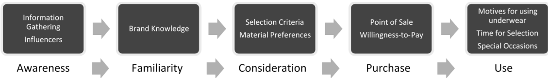
Figure 2: Implemented Version of the Triple-C-Model

Using the notation from Table 4, the „Triple-C-Model“ implemented in this study can be rewritten as seen in Figure 2.