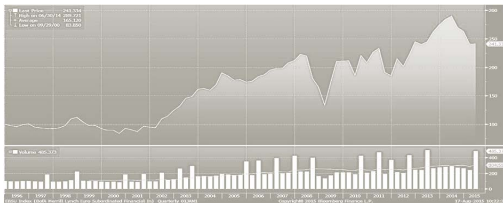
Figure 2: Merrill Lynch Euro Subordinated Debt Index Financial Institutions (Bloomberg, 2015)

Figure 2 presents the Merrill Lynch Euro Subordinated Debt Index for financial institutions to show the development of hybrid capital instruments accounted for as subordinated debt from 1996 to 2015. Due to its focus on financial institutions this index is a representative proxy for the developments of hybrid capital in the financial industry. The issuance of hybrids strongly increased since 2000 and sharply declined during the financial crisis in the beginning of 2008. Acharya et.al. (2011) provide further evidence that large stakes of the capital raised from 2000 to 2006 and even from 2007 to 2009 were in the form of hybrid securities such as preferred stock and subordinated debt. There exist a great variety of hybrids with sometimes more equity-like, debt-like or even insurance-like characteristics. Especially Asset-Backed Capital Commitment Securities (ABC) and Committed Preferred Custodial Trust Securities (CPS) were heavily used to fulfil regulatory capital requirements before the financial crisis according to Culp (2009).