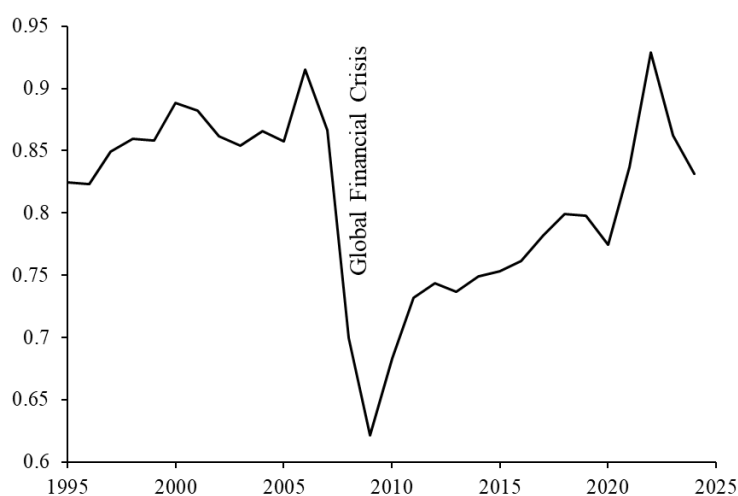
Figure 3 Intra-EU openness

Openness = (import within the EU + export within the EU)/GDP of the EU.