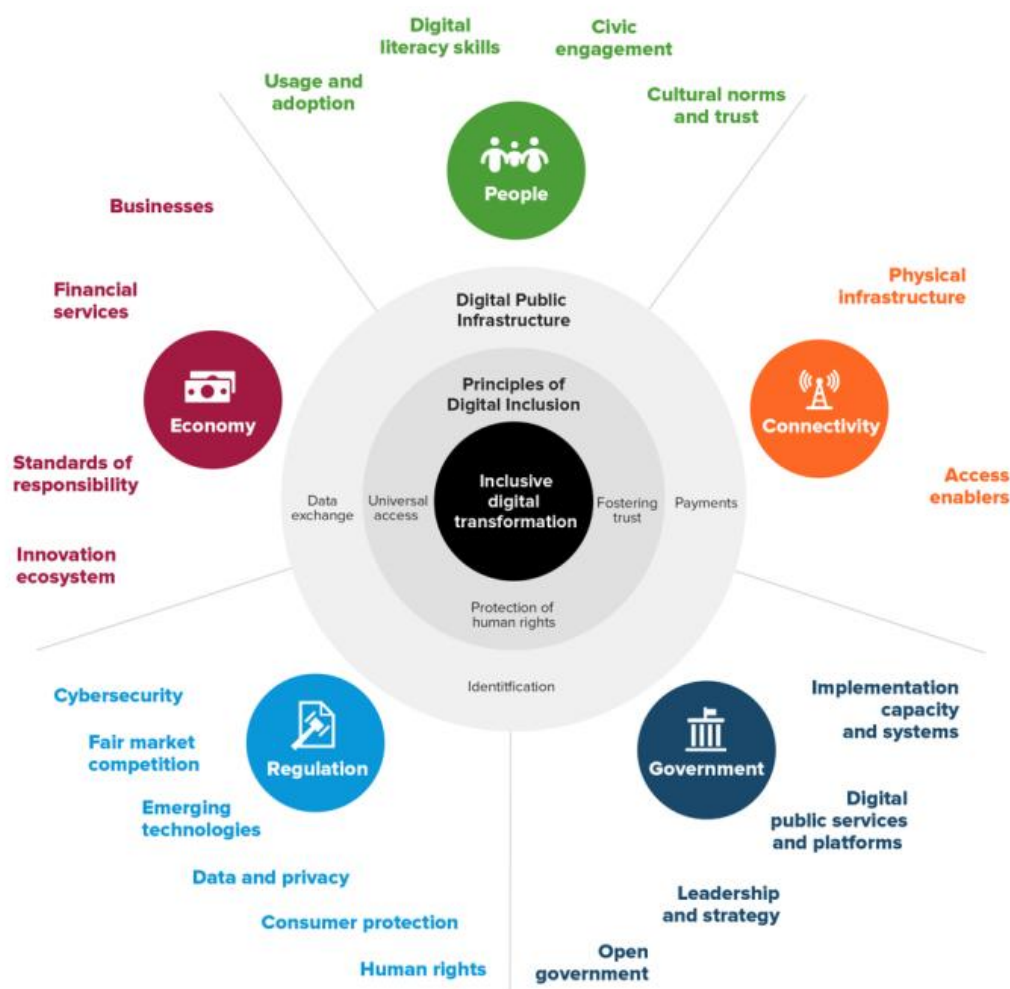
Figure 2: UNDP Digital Transformation Framework (UNDP, 2023)

The study used the UNDP Digital Transformation Framework (UNDP, 2023). The framework has five pillars that can be used to understand the level of maturity of digital transformation. The framework may also highlight strengths and weaknesses of the country to support policymakers in prioritise areas where strategies and policy programs can concentrate. The key assumptions of the framework are based on digital inclusive change in fostering human rights, universal access and trust when developing and using digital technologies. The five pillars of Digital Transformation Framework are people, connectivity, government, regulation, economy and digital public information (UNDP, 2023). Figure 2 summaries the five pillars of UNDP Digital Transformation Framework.