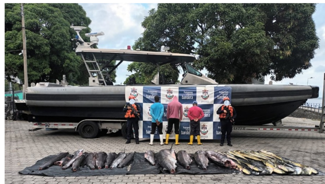
FIGURE 1 | Typical photo of a law enforcement press release on ‘illegal fishing’ in Colombia.

some comments included ‘the police should be ashamed!’, ‘the injustices of justice’ and ‘maybe she was hungry and has a family to feed, why are they treating her like a criminal, I hope [...] those crabs don’t go to waste’. Our writing in this symposium piece ripples from this outrage and our shared concern with the rapid increase in administrative and criminal sanctions that are disproportionately targeting fisher peoples and precarious fish workers, rather than transforming industrial exploitative relations.