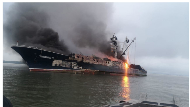
FIGURE 2 | Taurus I. Fire incident. Courtesy of the National Army of Colombia. Source: https://www.armada.mil.co/es/content/armada-colombia-rescata-29-tripulantes-una-embarcacion-en-emergencia .

We now turn to tuna processing factories and tuna companies to reveal what is excluded from the governance of IUU fishing. In the Public Audience on Companies and Human Rights (2023), a Black woman activist representing the Women’s Movement Board ( Mesa del Movimiento de Mujeres ) in Cartagena and Bolívar, which is part of the National Union of Food Industry Workers (SINALTRAINAL), denounced human rights violations from Seatech International Inc. (owners of Van Camp’s), one of the four main tuna industry companies in Colombia. She explained that this has been a long-term struggle of more than 11 years, as most workers are subcontracted (approximately 1700