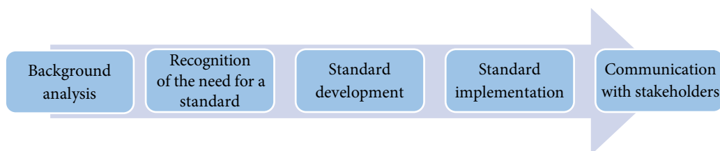
Figure 2. Stages of business standard development and implementation

The first step is to involve business representatives of a particular industry or region in the development of the standard. Their participation is not merely desirable, but necessary, as they are the ones who best understand the specifics of their industry, its main challenges and real needs. This approach will ensure that the standard developed will be as adapted to the realities as possible and useful for business stakeholders.