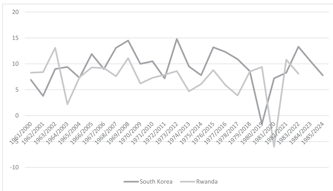
FIGURE 4 | Growth of GDP in % in South Korea (1961–1985) versus in Rwanda (2000–2024).

sector (Weerdesteijn 2019, 226; Takeuchi 2019, 132). Nowadays, still about 70% of the workforce in Rwanda operate in the informal sector (Bertelsmann Stiftung 2020, 19).