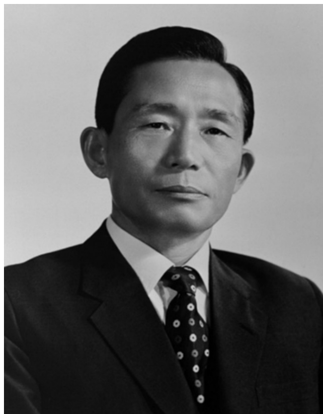
FIGURE 1 | Park Chung-hee (1950).

In contrast, Paul Kagame was born in 1957 in what was then the Belgian colony Rwanda. His family was quite prosperous and had close ties to the royal family (Soudan 2015, 14–15). His early years were marked by ethnic tensions and political instability, including the impact of the 1959 Rwandan Revolution and the subsequent Hutu-Tutsi conflict (Gourevitch 2000, 59). The Tutsi Kagame and his family fled to Uganda during the 1960s, where he grew up in exile and later joined the Ugandan rebel forces, eventually becoming a key military leader in the Ugandan National Resistance Army. His early exposure to armed struggle and political turbulence in Uganda significantly influenced his approach to leadership when he emerged as a key figure in the Rwandan Patriotic