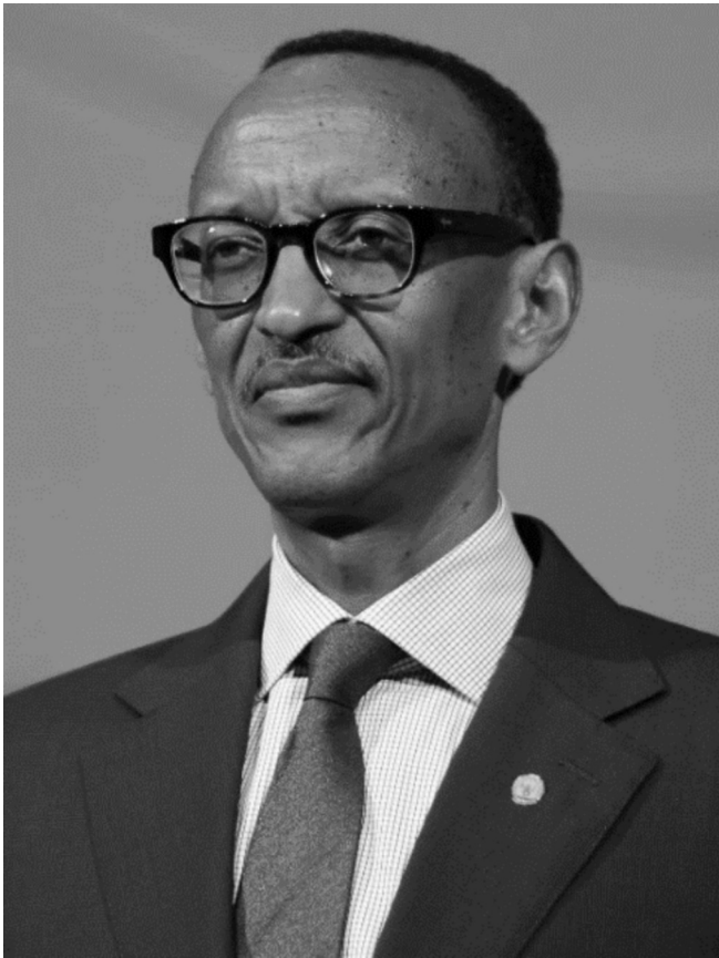
FIGURE 2 | Paul Kagame (2010).

Front and later assumed power in Rwanda following the genocide (Weerdesteijn 2019, 226–227). In conclusion, it can be asserted that before ascending to power, Park Chung-hee and Paul Kagame experienced notably different early years that shaped their paths to leadership, but both are characterized by military experiences in a foreign army.