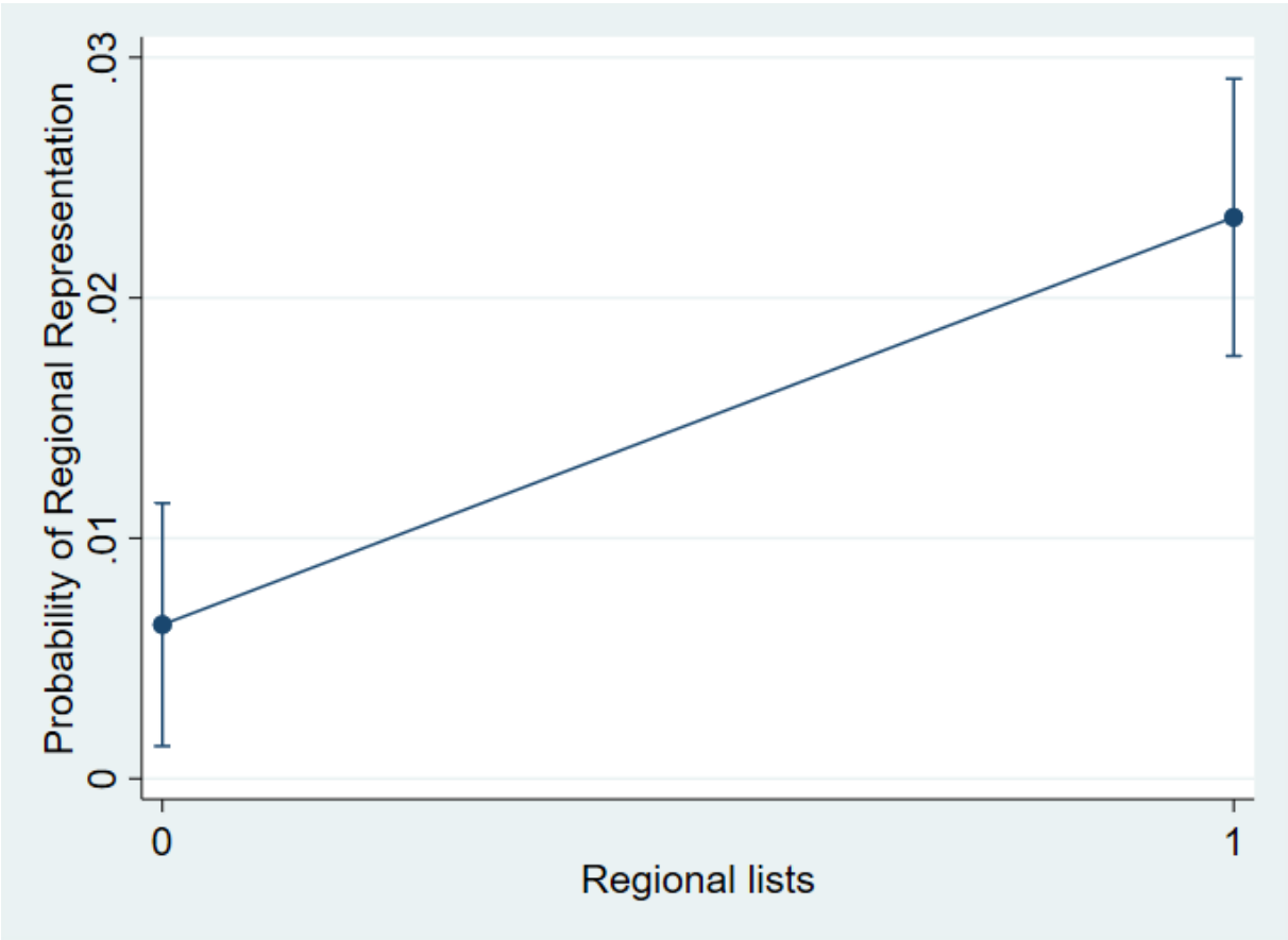
Figure 2. Predicted probability of Regional Representation based on Model 2.

Figure 2 illustrates the substantive significance of Regional lists , confirming H2.