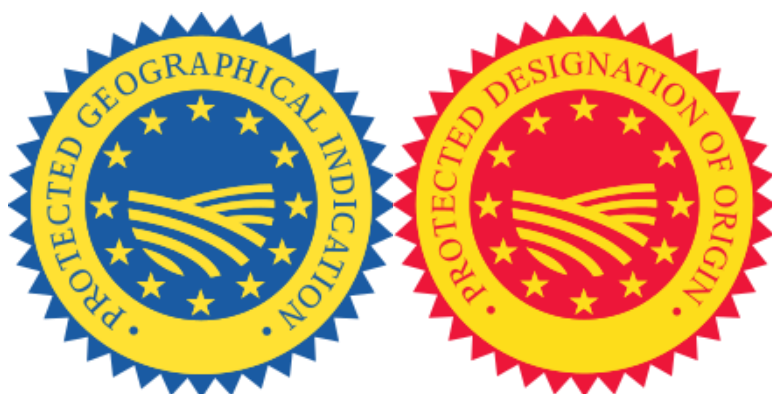
Figure 1. Product logos for PGIs and PDOs

Take the example of lemons from Sorrento PGI: they have to be grown in an area of 137 hectares around the Italian city of Sorrento. However, in many cases the link is not quite as intuitive. This section lists some examples of the limitations of the GI-origin nexus. 1