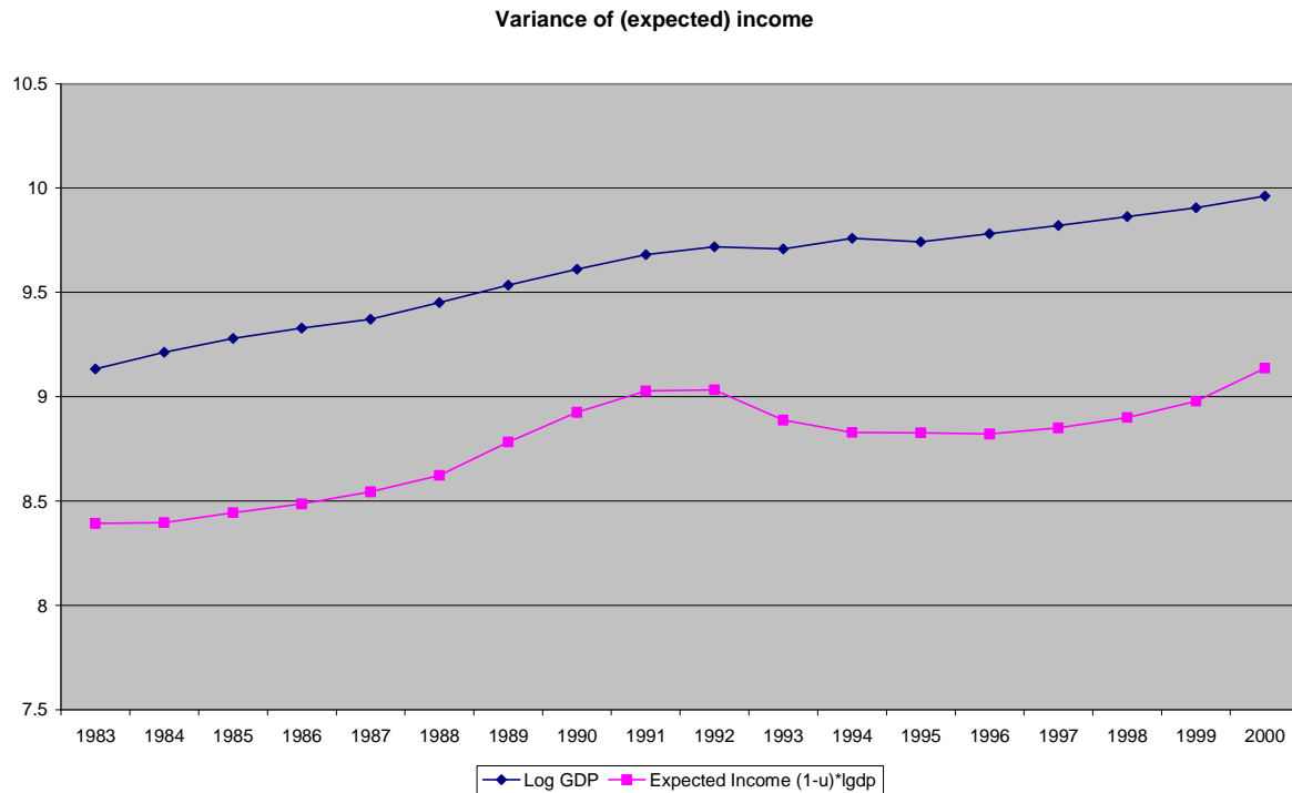
Figure 3.3 Variance of expected income and income

Second, the return to the relatively low rates of migration of the 1980's is not worrying as such, what matters is whether the rate of migration is low despite high incentives to migrate. Figure 3.3 presents some indicators of the incentives to migrate. The upper line in the figure depicts the variance of the log of per capita GDP. The slight increase indicates that the regions in our sample have not converged in the period under consideration (see, for a similar finding, Barro and Sala-i-Martin, 1991).