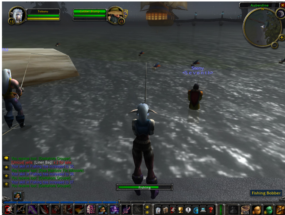
Figure 1: Player Fishing in WoW

The probability of a fish taking the bait does not depend on how many fish are already caught at the particular pool. However, the probability that the agent catches the fish depends on some fishing experience, the “fishing skill”, which increases with the number of catches already made. 18 The fishing skill, which can be looked up for every character in an online database, ranges between 1 (freshman) and 375 (master). Some pools require a minimum skill, such that the probability to catch fish is zero for fishing skills lower than the minimum one; other pools have maximum skills, such that the probability to catch fish is one for fishing skills higher than the maximum one. Notice that the pool where we require participants to fish has no minimum, but a maximum skill level of 75. 19 Therefore, the fishing skill tells us first the effort needed to catch a certain number of fish (so that the number of returned fish is a useful proxy for effort) and, second, the willingness of a player to fish in WoW. We cannot measure the disutility of fishing; however, the skill provides information about the willingness to perform the task previously.