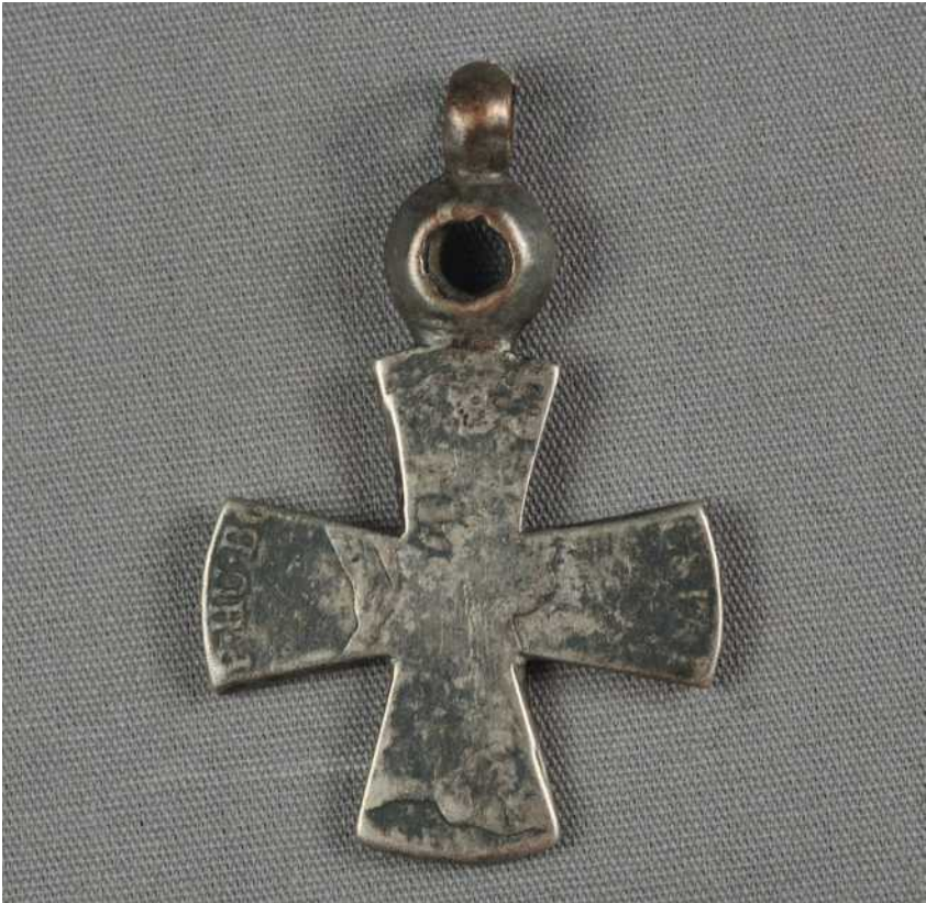
Figure 20. Maria Theresa thaler “Cross Pendant,” Ethiopia (Courtesy of The Spurlock Museum, University of Illinois at Urbana-Champaign, 2012.03.0699; see p. 127).