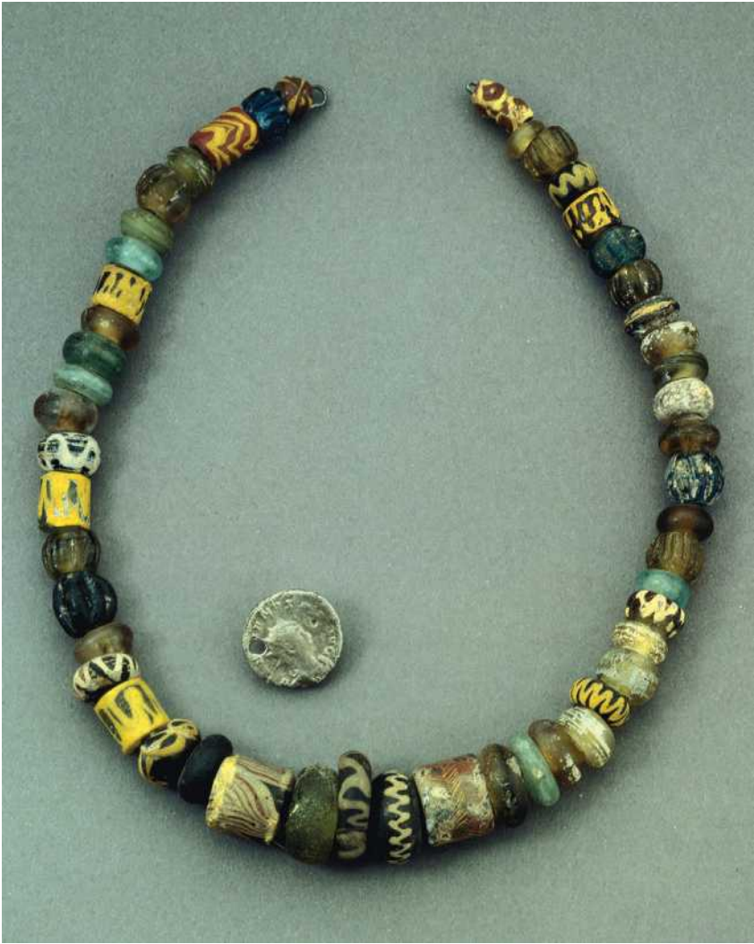
Figure 5. Perlenkette , “Bead necklace,” France, Merovingian period, c. 600 (Staatliche Museen zu Berlin, Museum für Vor- und Frühgeschichte, Klaus Göken, Va 5737, CC BY-SA 4.0; see p. 126).