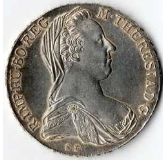
Figure 19. Maria Theresa thaler, Günzburg Mint, Austria, 1780 (Wikimedia Commons, CC0; see p. 129).