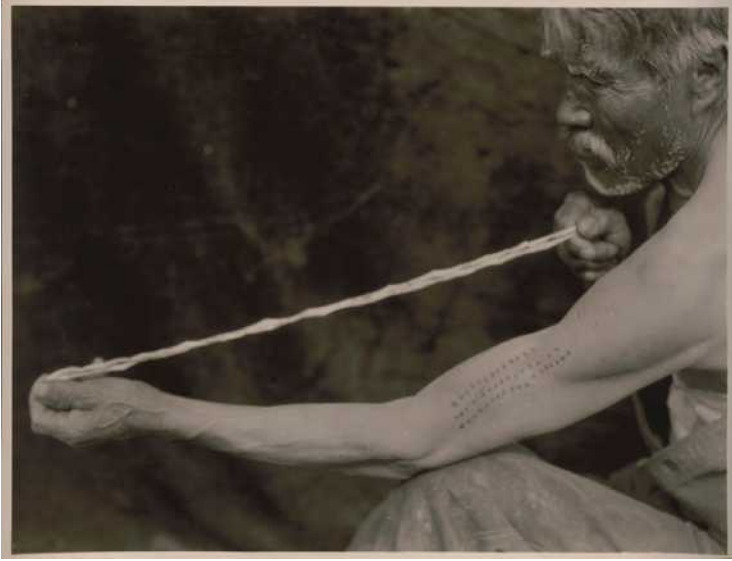
Figure 7. “Measuring shell money,” Tolowa, California, c. 1923 (see p. 49).