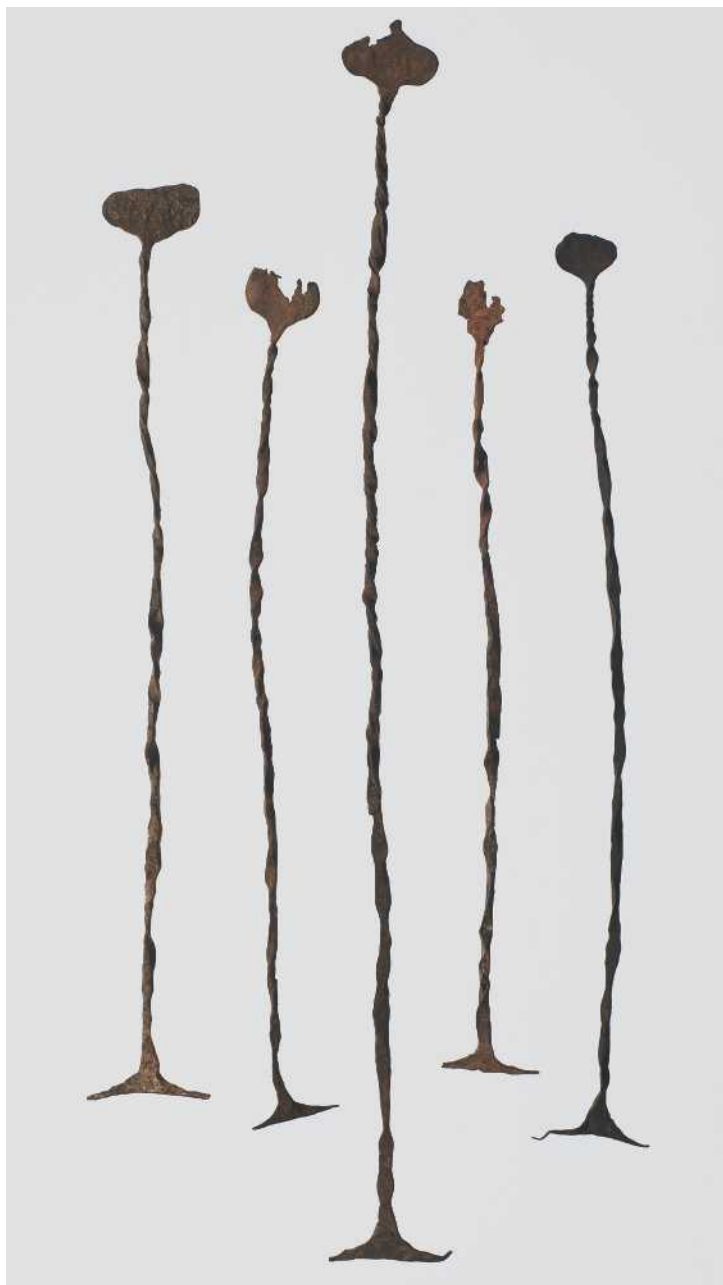
Figure 6. “Kissi iron currency,” West Africa, 1863 ( ; see p. 145).