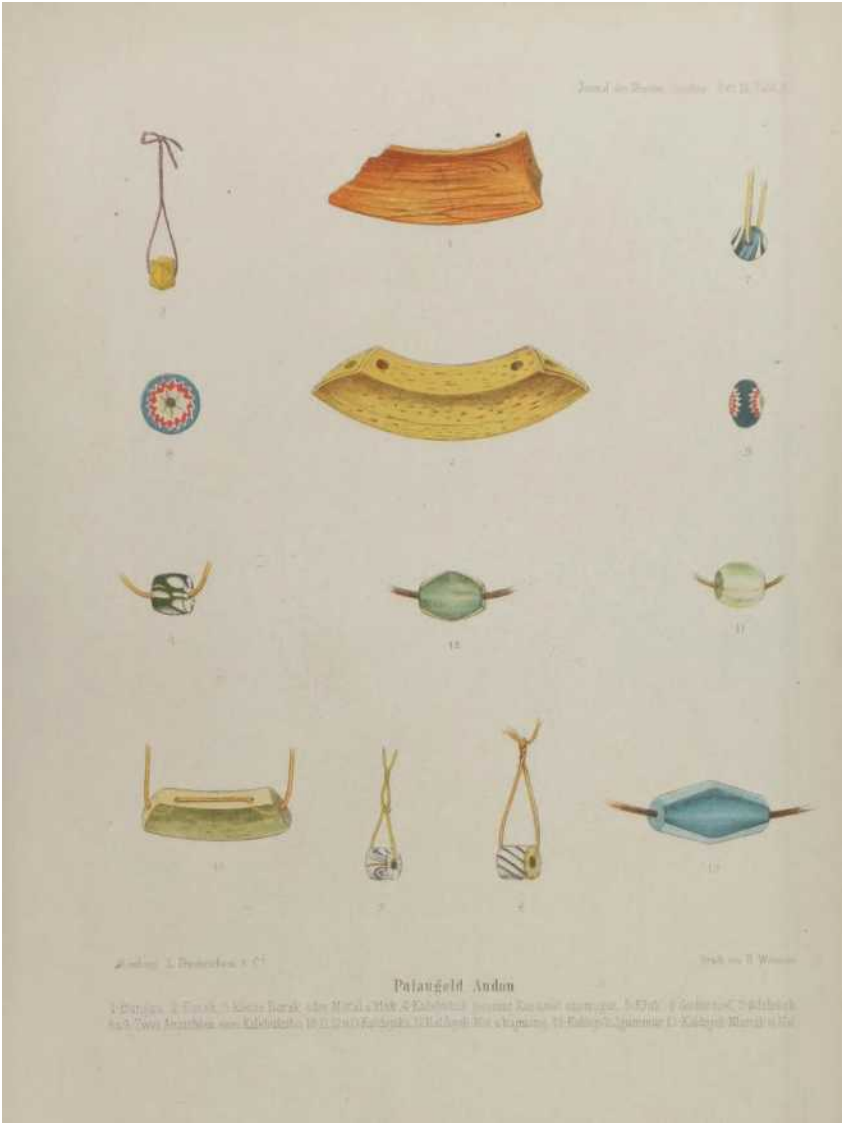
Figure 16. Palau Geld , “Money from Palau,” Micronesia, c. 1873 (Kubary 1873: Table 2; see pp. 53, 60, 157).