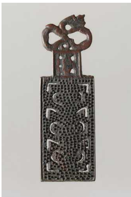
Figures 1 and 2. “Coins,” Han dynasty, China, 206 BCE–220 CE (The Metropolitan Museum of Art, Gift of Edward B. Bruce, 24.13.20 and 24.13.17, CC0).