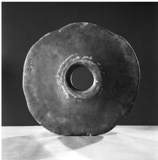
Figure 11. Yap stone money, Caroline Islands (Courtesy of the Penn Museum, Gift of Dr. William H. Furness, P1744; see pp. 47, 52).