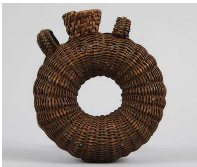
Figure 12. “Basket.” Quiggin (1949: 47) ascribes this to the Bambala, Congo, and says they were used for carrying nzimbu shell money (Department of Anthropology, Smithsonian Institution, E169131; see p. 116).