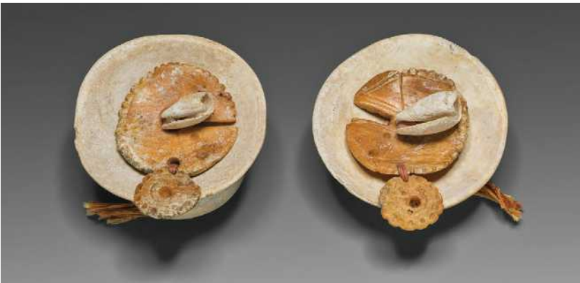
Figure 4. “Ear spools,” jewelry made of spondylus shell, Colima or Jalisco, Mexico, 200 BCE–200 CE (The Art Institute of Chicago, Maurice D. Galleher Endowment, 2001.152.4-5, CC0; see p. 112).