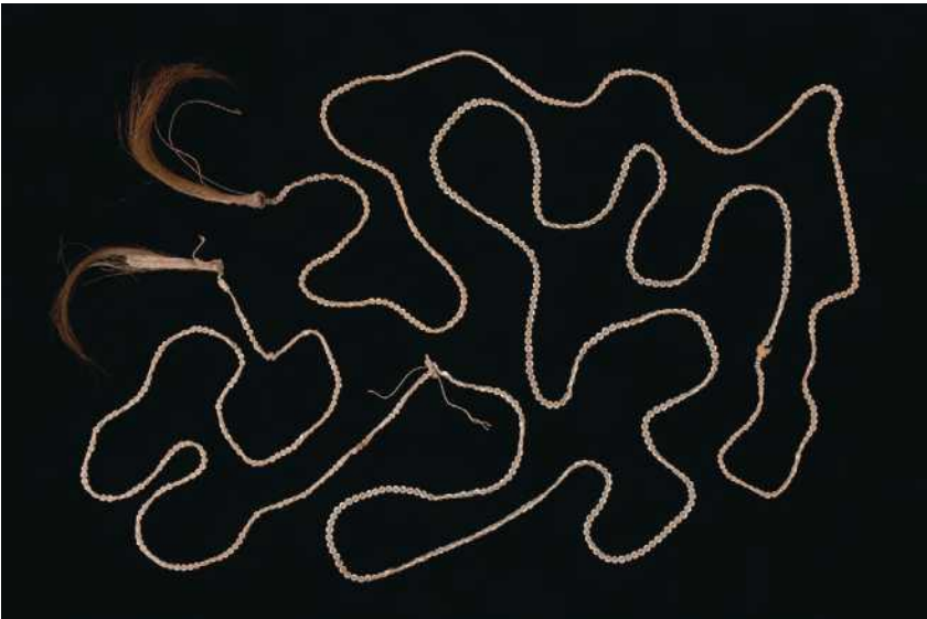
Figure 18. “String of shell bead money,” New Ireland, Bismarck Archipelago (Copyright Pitt Rivers Museum, University of Oxford, 1900.9.1; see p. 89).