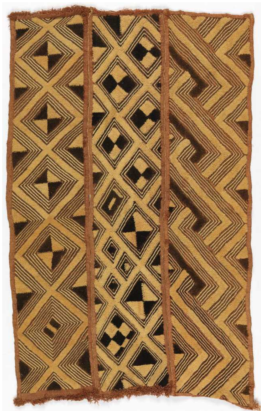
Figure 10. Raffia “Status cloth,” Kasai, Congo, c. 1850 (Cooper Hewitt, Smithsonian Design Museum, 18411465, CC0; see p. 135).