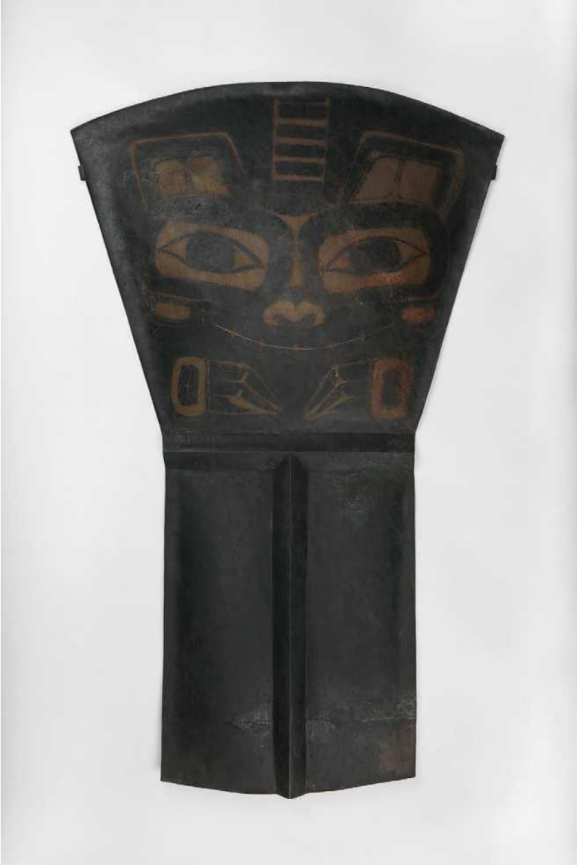
Figure 21. “Tlingit copper,” Haida Gwaii, British Columbia (Courtesy of the Penn Museum, 29-31-1; see p. 62).