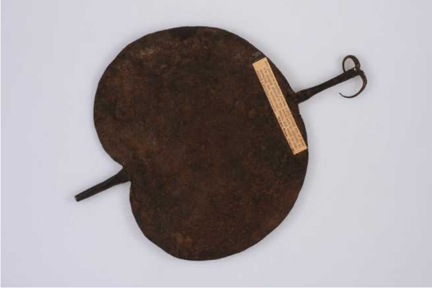
Figure 17. “Iron spade blade currency,” Zande or Bongo, Central Africa, c. 1850s ( ; see p. 148).