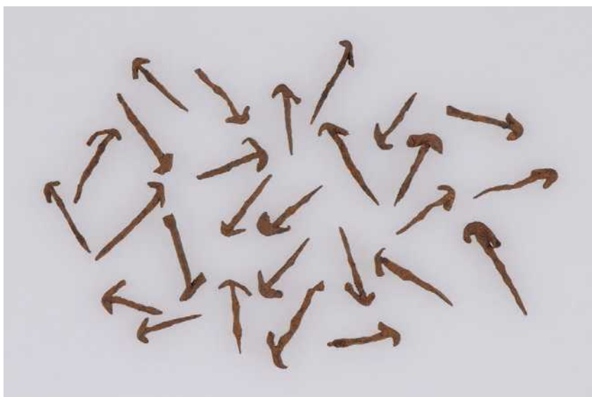
Figure 14. “Iron currency,” shaped like a miniature arrow, Akwa, Nigeria ( ; see p. 148).