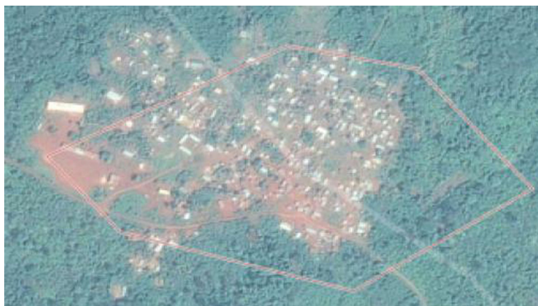
Figure 2. Chorichori: study site.

countries and other parts of Ghana, primarily from the north, used to do business in the study area. Unfortunately, the emergence of the cocoa swollen shoot virus disease in recent years has caused a massive decline in the economic activities of these migrants in and around the study area. Over 75% of the people in the area work in agriculture, farming cocoa and food crops including plantain, cassava, vegetables, and rice, among others (Schulte-Herbruggen, 2012). The climate, soil type, topography, and other characteristics of the study location make it ideal for cocoa cultivation. The community is connected to the national electricity grid. Other social amenities of the community include a basic school up to junior high level, a community centre, two boreholes, a river, two public pit-latrines, a community health planning and services (CHPS) compound, nine churches and a mosque. The main cooking fuel used by the community dwellers is wood and the primary building materials are metal roofing sheets, cement floors, and mud or clay for the outer walls. About 84 percent of the people in the community grow cocoa, making it a fair representative for the rural cocoa farming communities. However, the survey does not claim to be completely representative of Ghana but anticipates that the findings based on this sample will serve as a useful estimate for rural cocoa farmers when broadly interpreted.