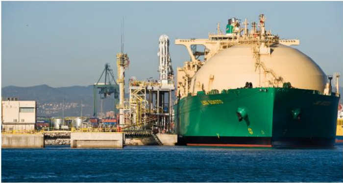
Figure A2. Example of 50%.