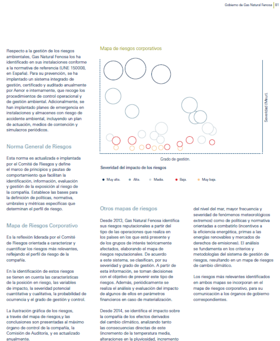
Figure A1. Example of 100%.

The following images are extracted from the sustainability reports of the firms included in the sample. With these examples, we intend to explain how the page count for the quantity index was corrected. In Figure A1, we can see a page that would count as 100%, since the text covers all the space, and there is an image. But, it is informative. It provides information rather than just decoration.