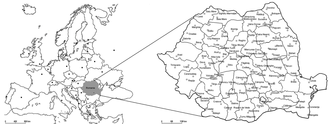
Figure 1. (left) Location of Romania in Europe; (right) the counties and municipalities of Romania.

into 41 counties (see Figure 1 right), with each of them having a different number of municipalities (103 in total), cities (216), and towns (2862).