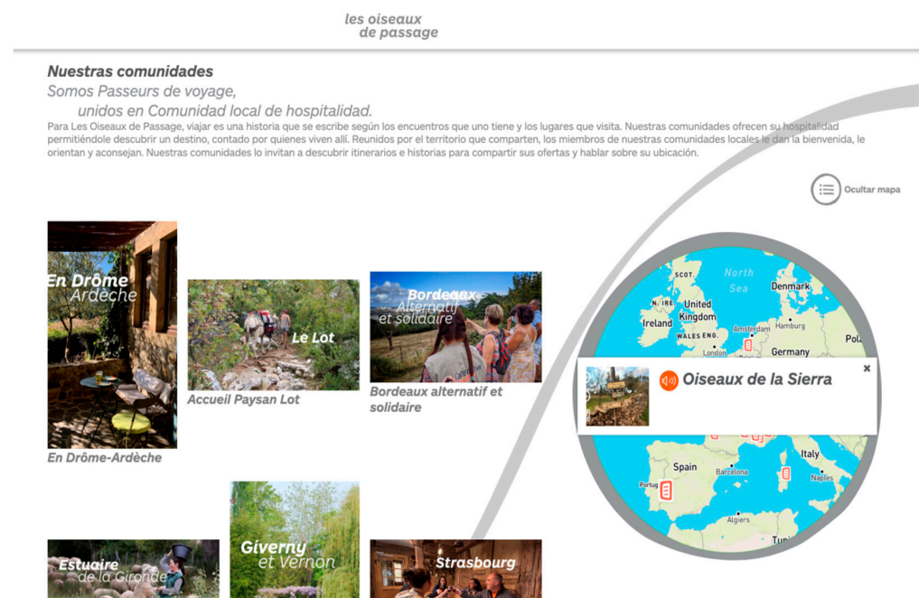
Figure 1. The ‘Aves de la Sierra’ community on the ‘Oiseaux de Passage’ webpage.

The articulation of these actors has materialised through a collaborative governance structure that includes regular face-to-face and online coordination meetings, thematic working groups and training, and co-creation spaces. This structure has allowed the development of a shared vision of the project and the establishment of working protocols that respect the capacities and rhythms of each actor, while maintaining the regenerative approach as the central axis of tourism development.