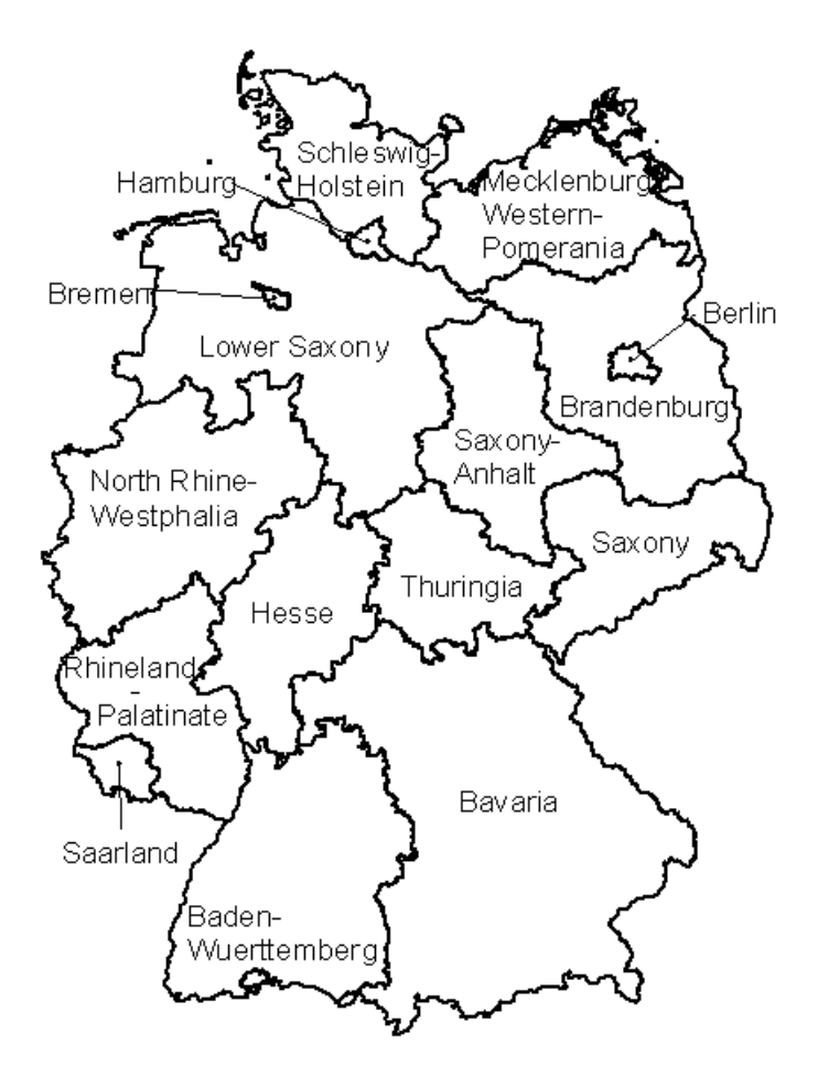
Figure 1. The Federal States of Germany