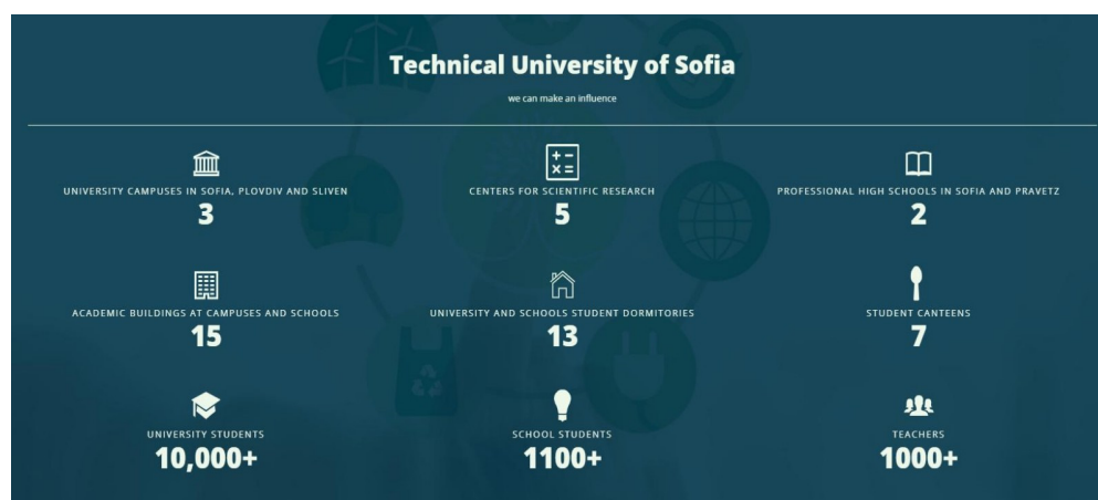
Figure 1. Technical University of Sofia as an object of the case study—numerical data.

of TU-Sofia, including students, and academic and non-academic staff, exceeds 13,000. According to data from the National Statistical Institute of Bulgaria, 13.4% of the country's population lives in settlements with a similar average number of inhabitants. TU-Sofia also has a large number of buildings with different functions, the maintenance and operation of which require considerable resources. The total floor area of the buildings is 394,837.7 sq.m and they are situated in various cities in the country. Figure 1 shows the number of different types of buildings and people involved in the educational processes, both are key factors influencing the achievement of sustainable development.