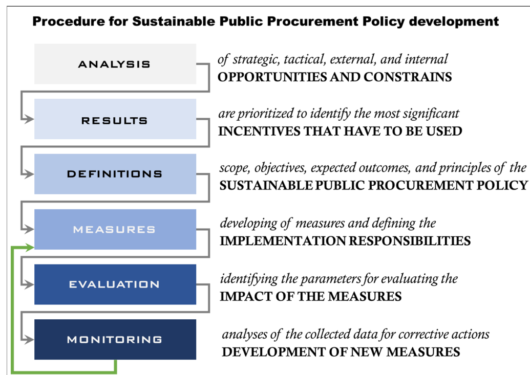
Figure 4. Procedure for Sustainable Public Procurement Policy development.

Step 2. The strong leadership commitment that is evident in the overall activities of TU-Sofia can be defined as a most significant opportunity. The university strives to function as a leading research and educational institution, integrating sustainability in all its activities. The articulated vision is evident in the institution's overarching mission—to excel as a leading research and educational institution. The vision is emphasized by the university's commitment to integrating sustainability into every aspect of its activities. The leadership recognizes that decisions and actions related to the purchase of goods, services, and works have not only an economic but also social and environmental impact on society and the environment. TU-Sofia considers this as a valuable opportunity to consolidate its position as a leading European research and education center, applying the principles of the SD concept in the field of public procurement. At the strategic level, there is consistency between the university's overall strategy and sustainability strategy. Based on this, the development and implementation of SPPP aims to integrate environmental and socio-economic aspects in all stages of the procurement management process.