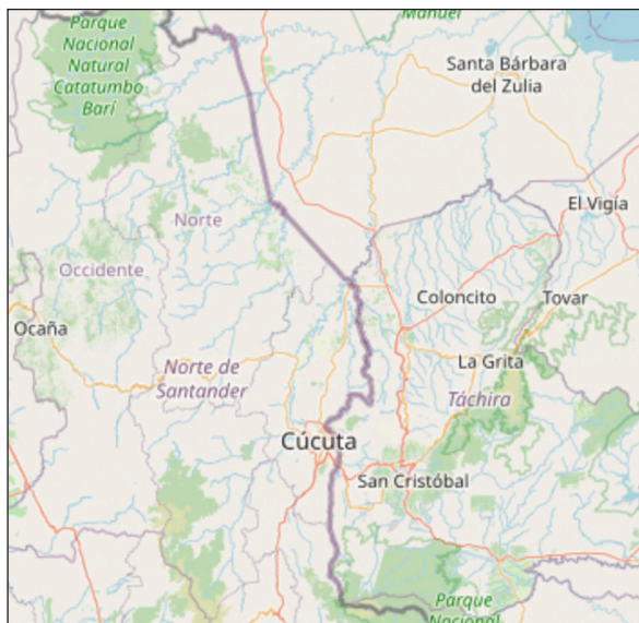
Map 1 Norte de Santander and Tachira. 14

While critical of the peace deal signed by his predecessor, President Duque (2018–2022) implemented a policy called ‘Peace with Legality’. 9 One of its ten pillars is the ‘transformation of territories’ through Territorially Focused Development Plans (PDET), expected to stimulate production and investment and to improve education and infrastructure in conflict-affected areas. 10 After a start described by some interviewees as promising in terms of citizen participation, the PDET roll-out 11 slowed down while the security situation in contested areas remained tense and the state’s presence limited to its security forces. This can best be observed in the Future Zones, which are part of the PDET approach. 12 In Catatumbo, located in the Norte de Santander department (see Map 1 ), the Colombian government has set up a Future Zone supported by over 10,000 soldiers. As civil society organisations complained in a statement to the US Congress in 2021, rather than ‘opportune and effective responses’ to existing problems, this programme ‘has contributed to persistent high rates of violent actions against the population, as evidenced by the increase in numbers of homicide, forced recruitment of minors, and sexual violence; as well as the expansion of paramilitary structures’. 13