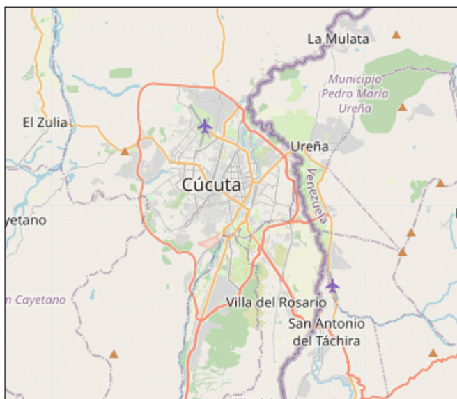
Map 3 San José de Cúcuta. 32

The Venezuelans entering through the two official border crossings in the Metropolitan Area of Cúcuta or using the ‘trochas’ to flee the dire conditions of their home country arrive at an inequitable city with a high level of absolute poverty that has doubled in recent years ( La Opinión 2021c). According to the National Administrative Department of Statistics (DANE), Cúcuta was the city with Colombia’s highest unemployment rate in 2021 (20.4 per cent in July of that year). 31 Further, it is the country’s city with the highest citizen perception of insecurity ( La Opinión 2021a). State provision of health services, education, and security – or lack thereof – is a constant concern. Limited formal economic opportunities have further turned Cúcuta into the city with Colombia’s highest informality rate ( La Opinión 2021b). The absence of formal jobs is also creating a labour force reservoir for illicit economies. With thousands of Venezuelans settling in the city since the death of then Venezuelan President Hugo Chávez in 2013, this reservoir has increased even further. The cross-border illicit economies that for many have become the only chance of income take very concrete forms in the city – in both the metaphorical and the literal senses of the word, as the next sections will demonstrate.