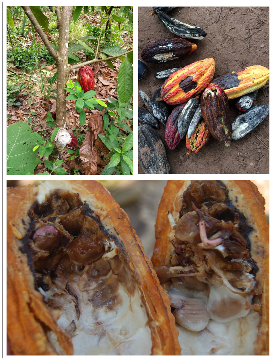
Images 4, 5 and 6: Photographs show cacao plants pruned of disease, as well as diseased and rotten cacao fruits, in different agricultural plots in the UHV and Monzón.

Second, our interviews, participant observation and analysis suggested that farmers who could and did participate in AD programs often struggled to obtain and sell their expected harvest of alternative crops and make a sustainable profit. Although these farmers often had access to larger plots and higher quality land, as well as other relative privileges as described above, they often had trouble seeing alternative crop cultivation as a profitable or promising option that would allow them to support themselves and their families. The factors that limited them were often circumscribed by pre-existing social and economic conditions that determined their access to resources, in ways that AD projects did not account for or overcome. Farmers who had less access to resources struggled more with the difficulties posed by factors such as their low expertise with export-quality crops, the crops' intensive growing techniques, the low productivity of their soils, the diseases and pests that plagued the crops (see Images 4–6 ) and the heavy dependency of alternative crops on fluctuating international market prices. One farmer in Monzón spoke to the difficulties he experienced in this process: