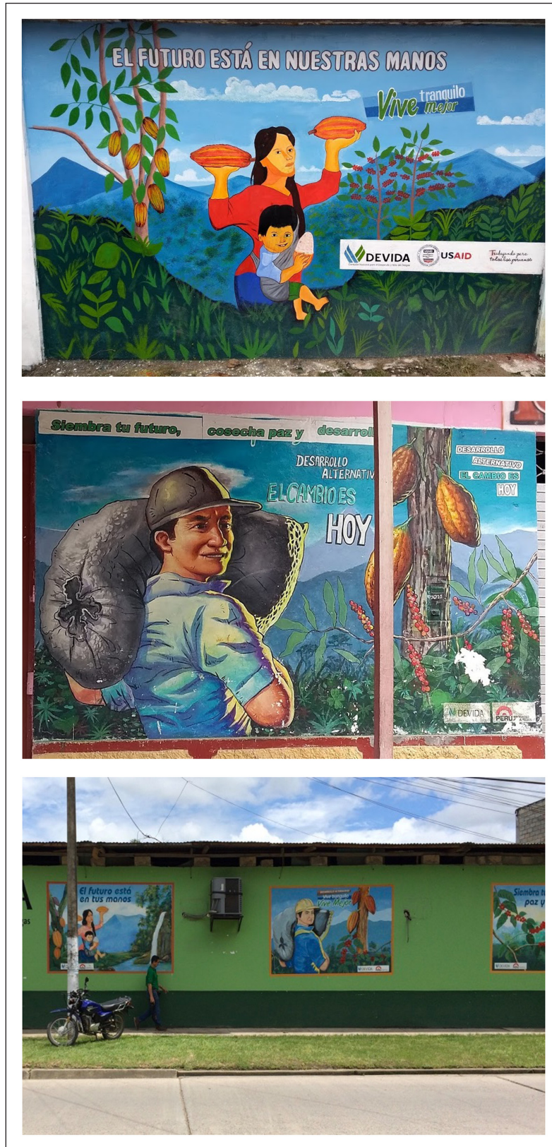
Images 1, 2, and 3: Murals in the UHV and Monzón advertise alternative development programs.

Image 1 from Monzón Valley, 'The future is in your hands. Live calmly, live better,' shows a woman carrying a child, both holding cacao fruits; along with DEVIDA and USAID logos. Image 2 from Monzón Valley, 'Sow your future, reap peace and development. Alternative Development, the change is today,' shows a man carrying a full sack next to coffee and cacao plants; along with logos from DEVIDA and the Peruvian state. Image 3 from UHV contains murals with the same phrases and images, each with logos from DEVIDA and the Peruvian state.