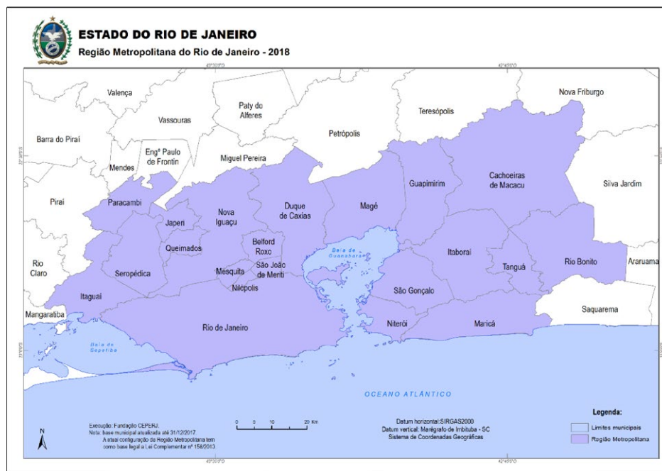
Figure 2: Shows the map of the metropolitan region.

proposed evacuation of about a thousand families from the sandy area to new homes would affect the collection of security fees significantly.