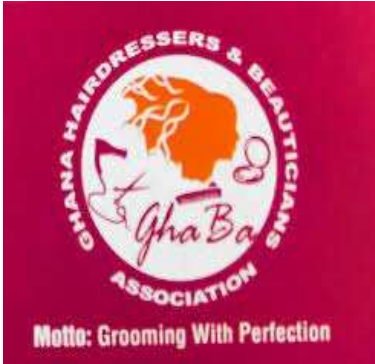
Figure A1: Examples of Business Associations Logos