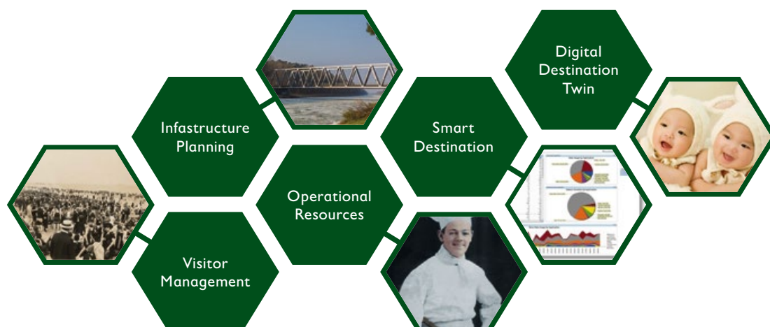
Figure 1: Five Motivations for Using Visitor Counts and Forecasts in Tourism Destinations

The paper presents five motivations for implementing visitor counts and forecasts in tourism destinations, with visitor management being the prevalent one. The authors conceptualize different forecasting methods based on available data sources and give concrete recommendations for destination managers.