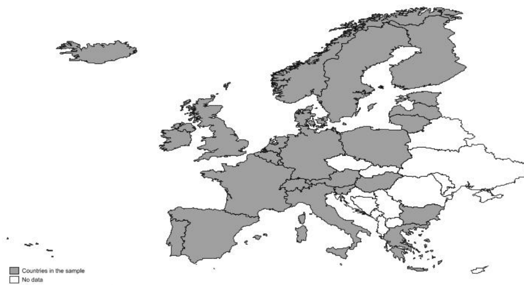
FIGURE 1. Countries in the sample

The measure of individual restrictions we adopt is the stringency index, edited by the Blavatnik School of Government at the University of Oxford. It is based on nine response indicators including school closures, workplace closures, travel bans, etc., rescaled to a value from 0 to 100. 1 Following Alvarez et al. (2021), we limit the analysis to 90 days after the country stringency index joined its maximum value ( T=0 ), which was expected to capture the overwhelming impact of the pandemic on governments' choices. As affirmed by Alvarez et al. (2021), “...the optimal policy prescribes a severe lockdown beginning two weeks after the outbreak... (which) is gradually withdrawn after 3 months.” 2